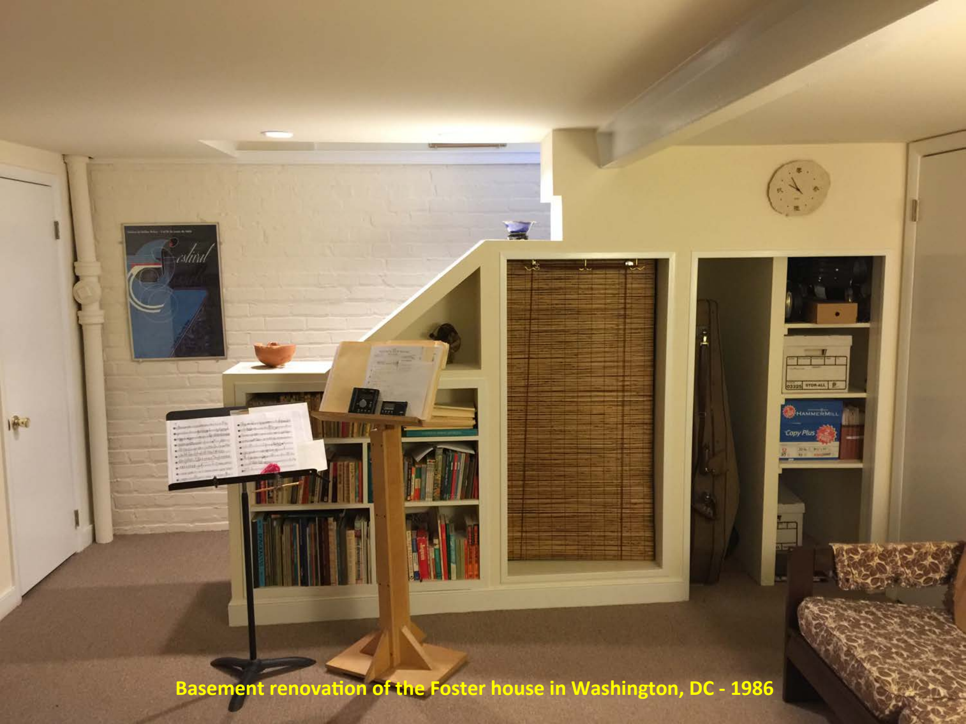
Basement renovation of the Foster house in Washington, DC - 1986