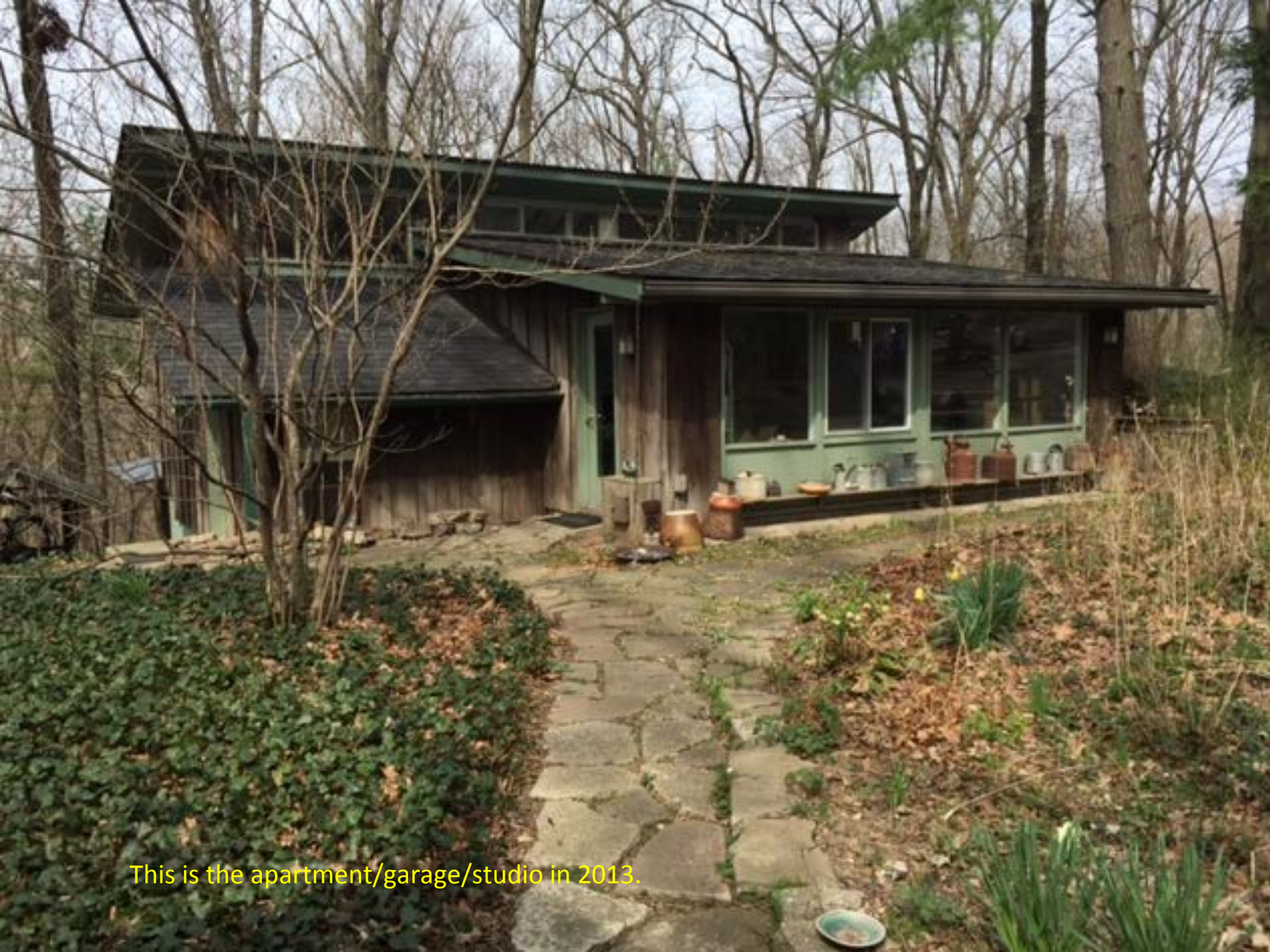
This is the apartment/garage/studio in 2013.