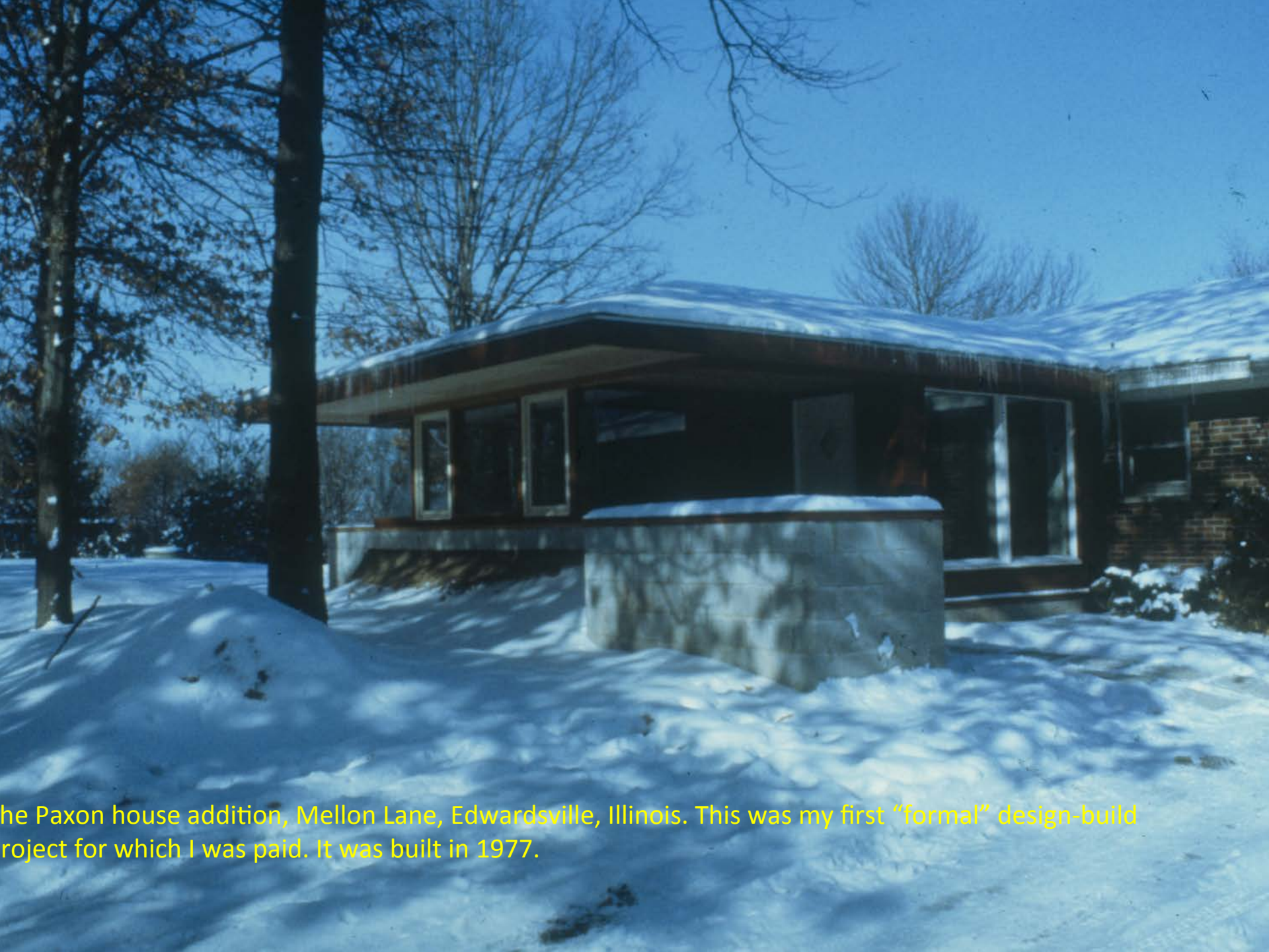
The Paxon house addition, Mellon Lane, Edwardsville, Illinois. This was my first "formal" design-build project for which I was paid. It was built in 1977.