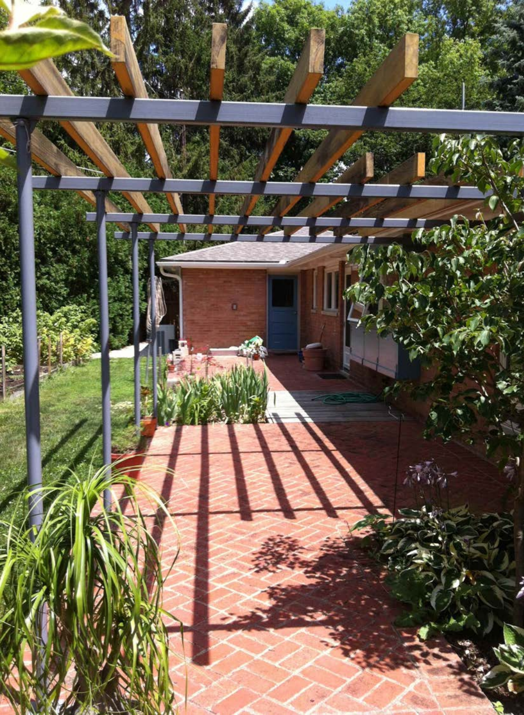
The trellis and patio behind our house in Muncie