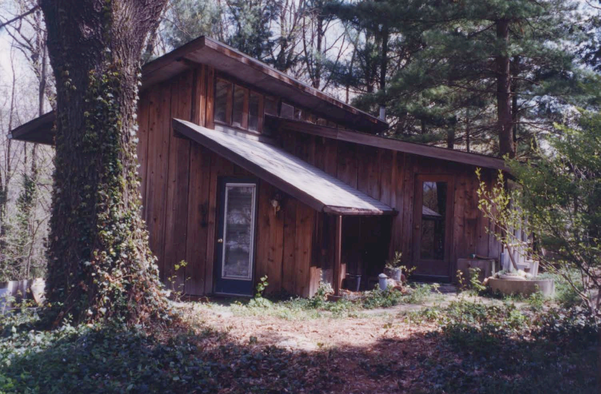
The door on the left leads to the split-level apartment; the door to the right leads into the studio