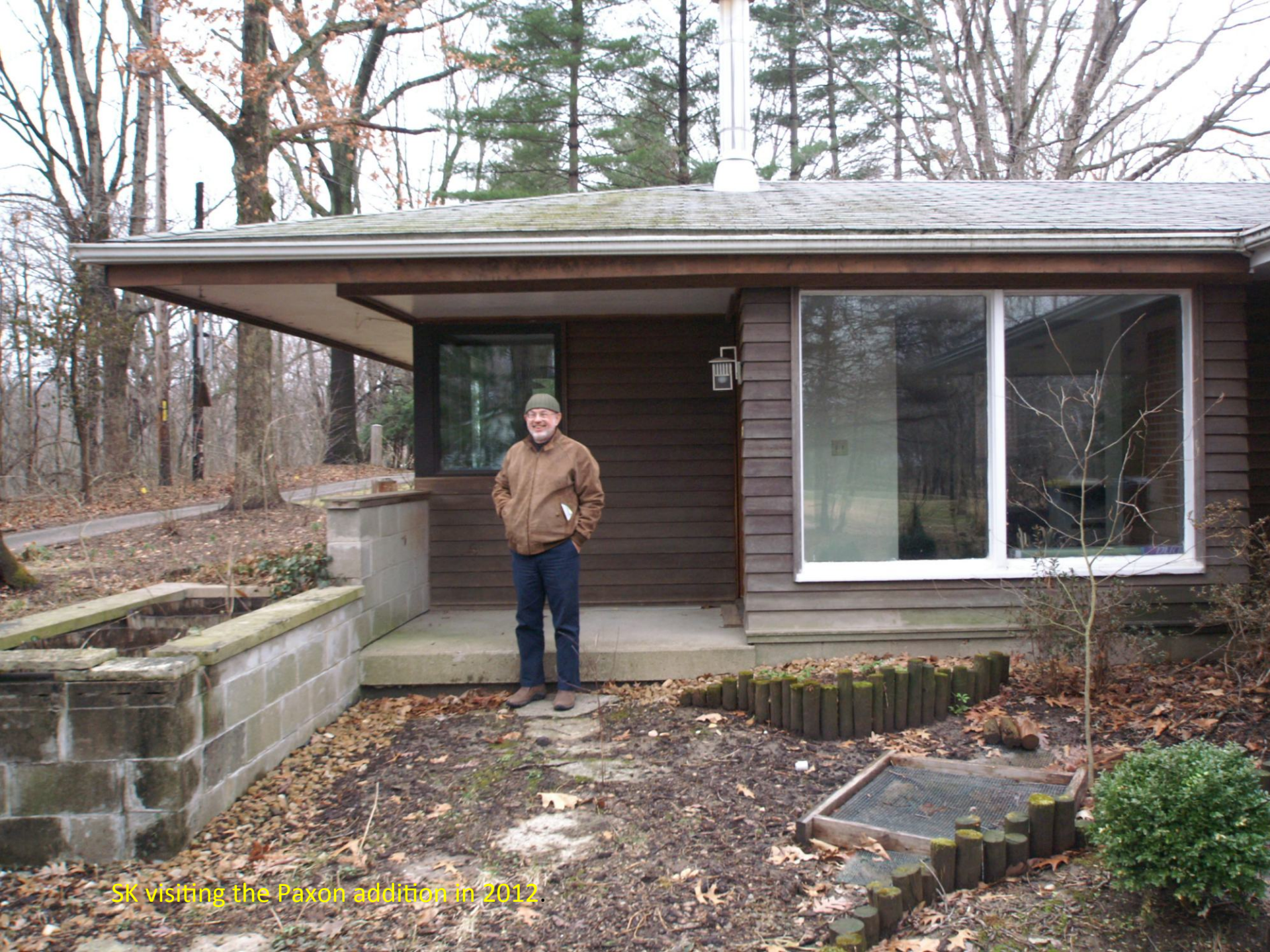
SK visiting the Paxon addition in 2012.