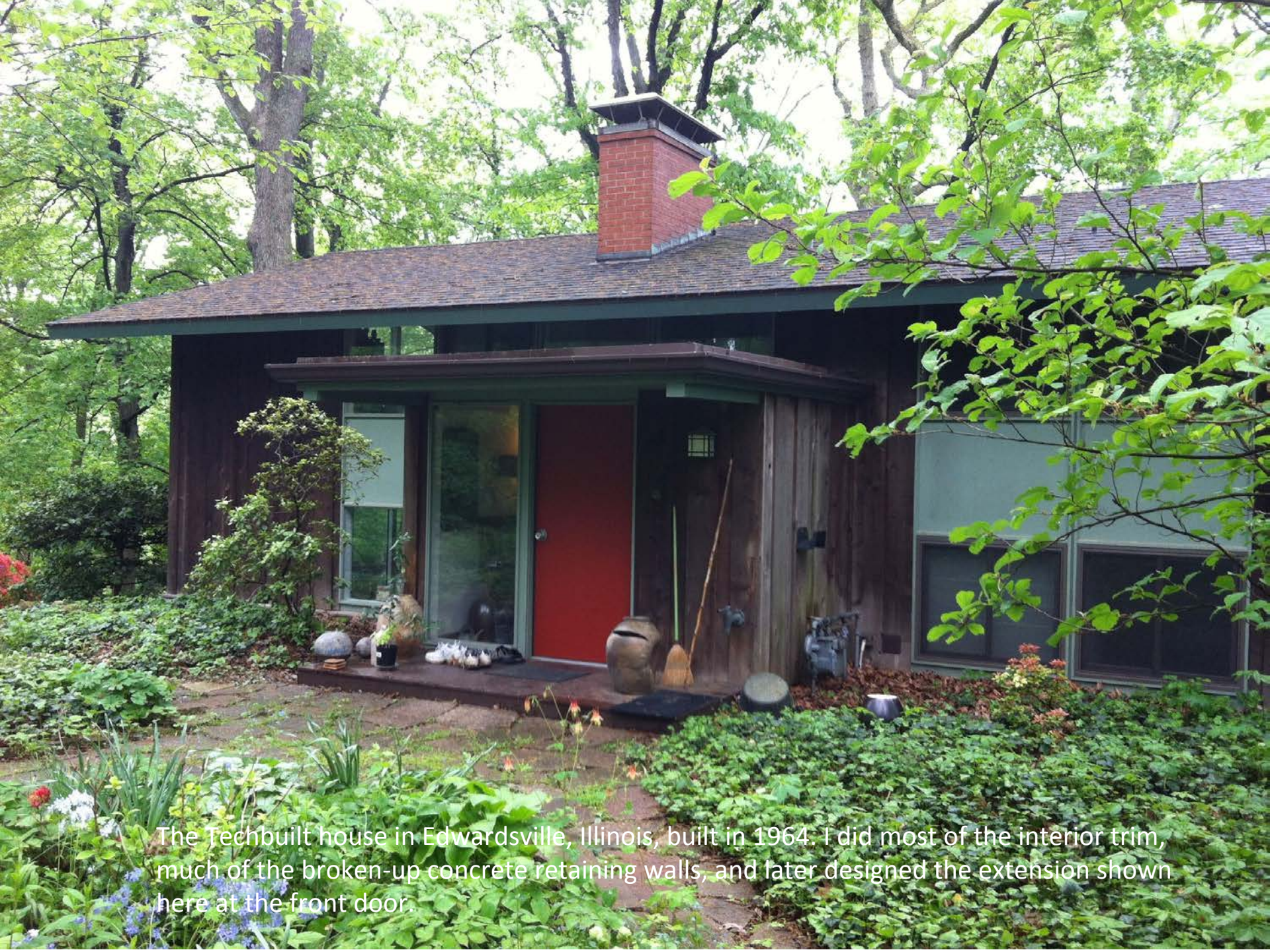
The Techbuilt house in Edwardsville, Illinois, built in 1964. I did most of the interior trim, much of the broken-up concrete retaining walls, and later designed the extension shown here at the front door.