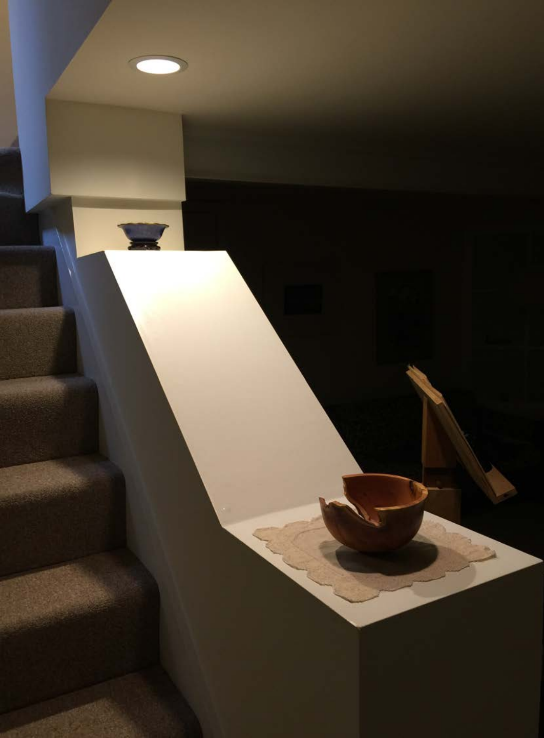
Detail of the basement renovation of the Foster house in Washington, DC - 1986