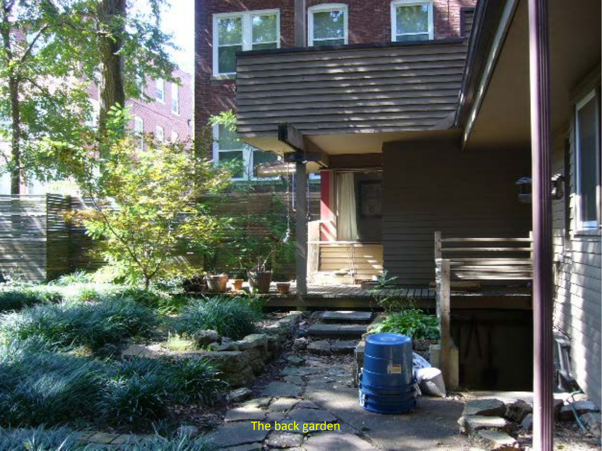
The back garden