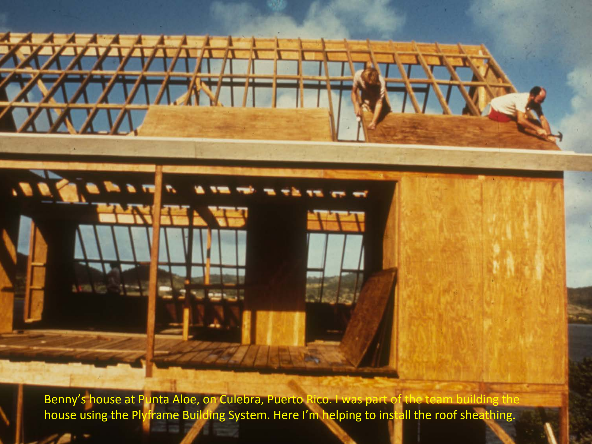
Benny's house at Punta Aloe, on Culebra, Puerto Rico. I was part of the team building the house using the Plyframe Building System. Here I'm helping to install the roof sheathing.