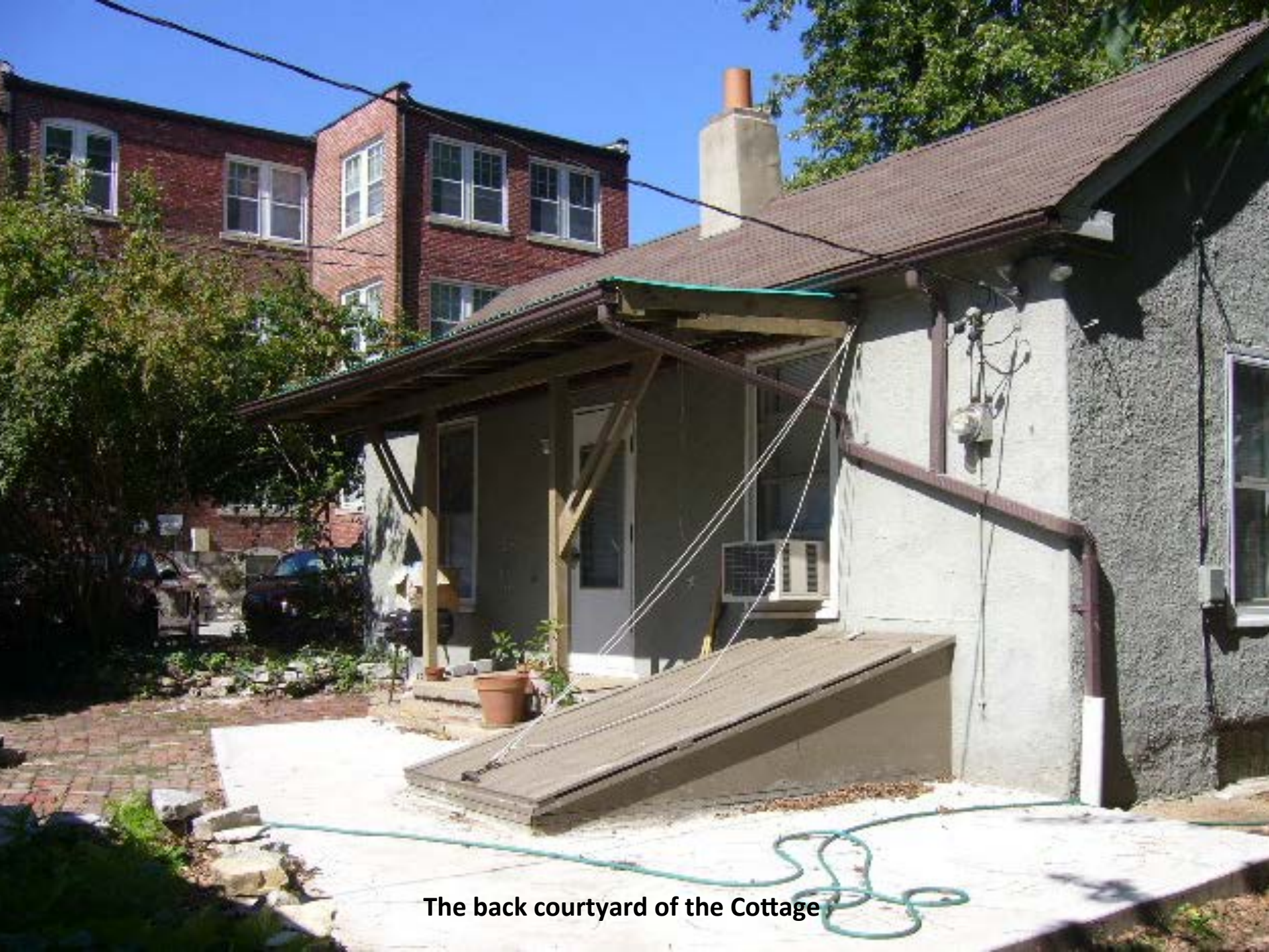
The back courtyard of the Cottage