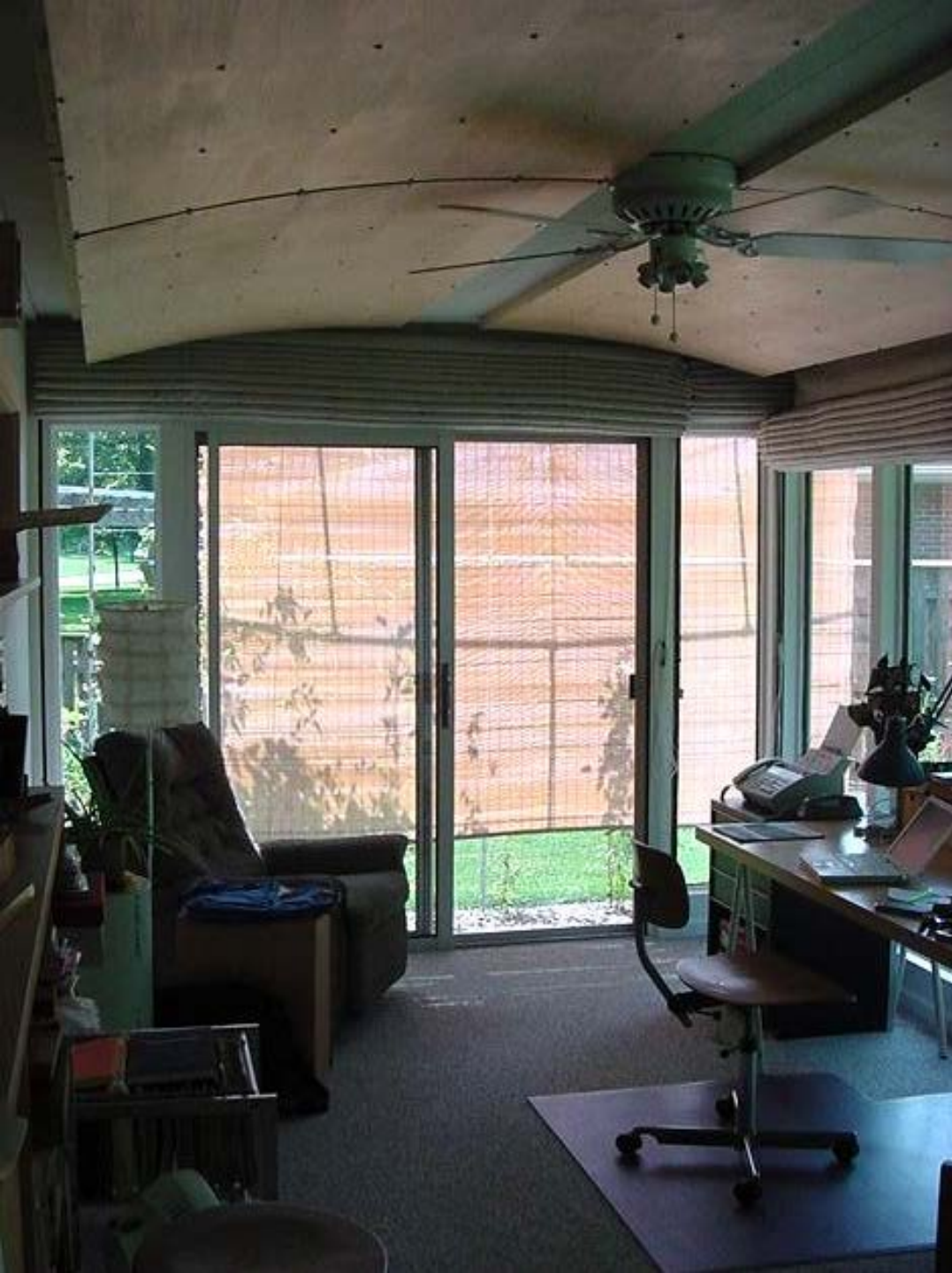
My first home office in Muncie, with the ceiling I installed