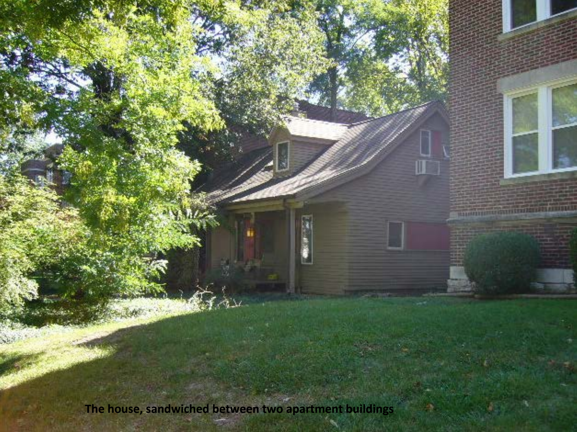
The house, sandwiched between two apartment buildings