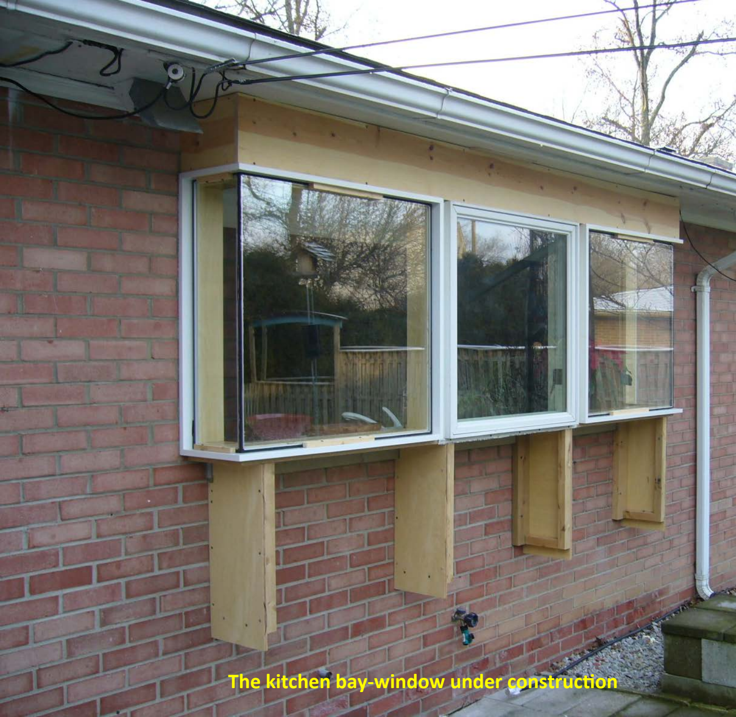
The kitchen bay-window under construction