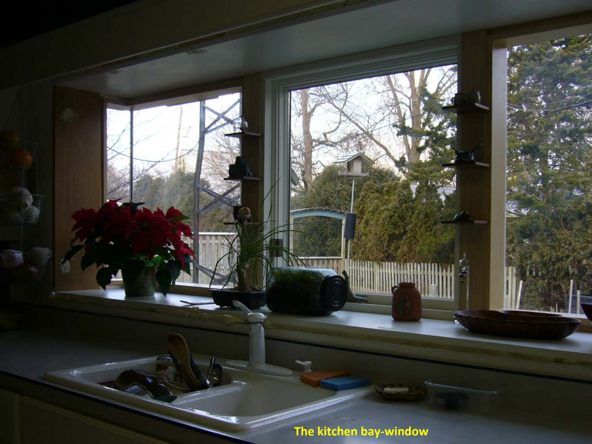
The kitchen bay-window