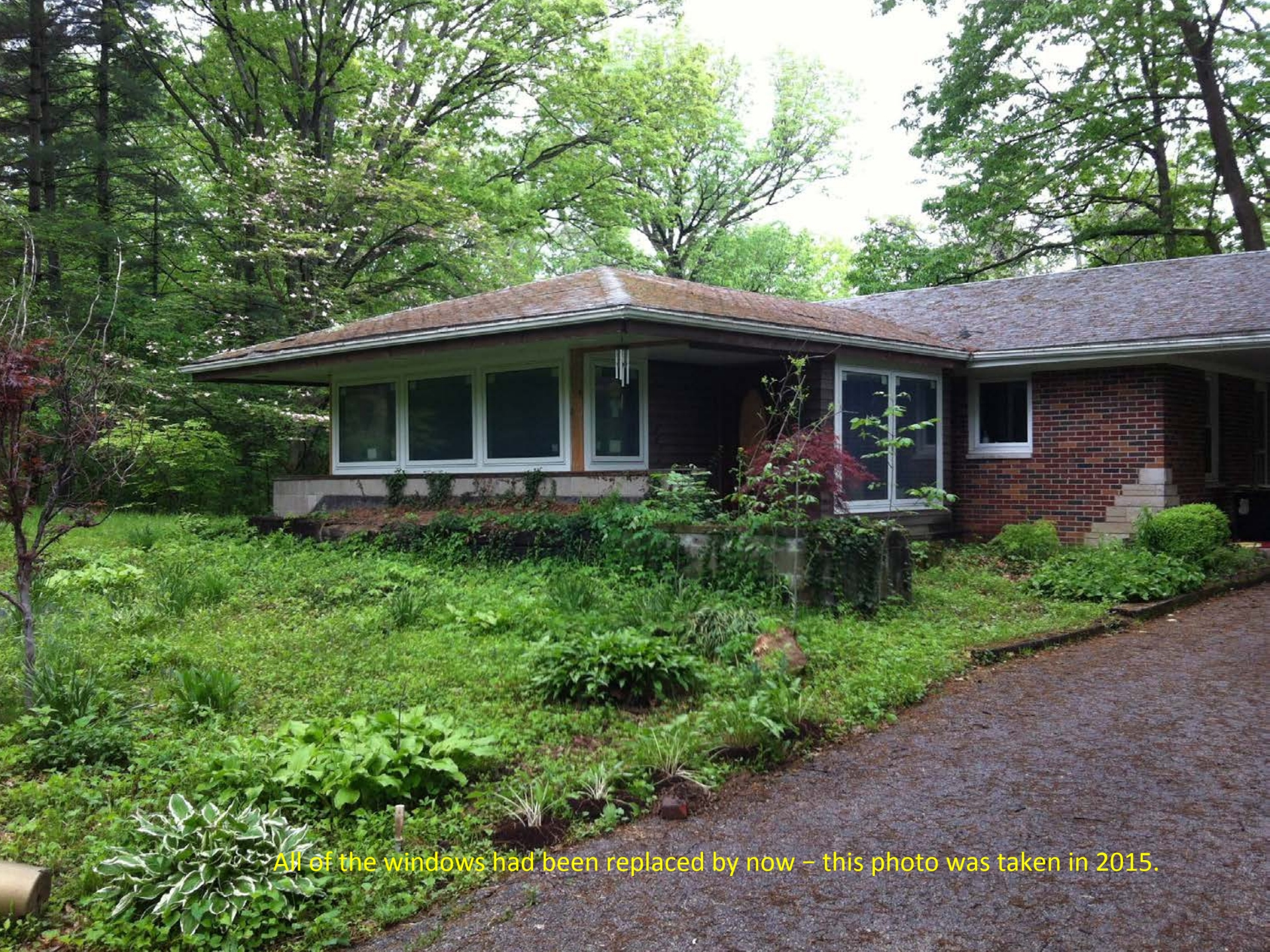
All of the windows had been replaced by now – this photo was taken in 2015.