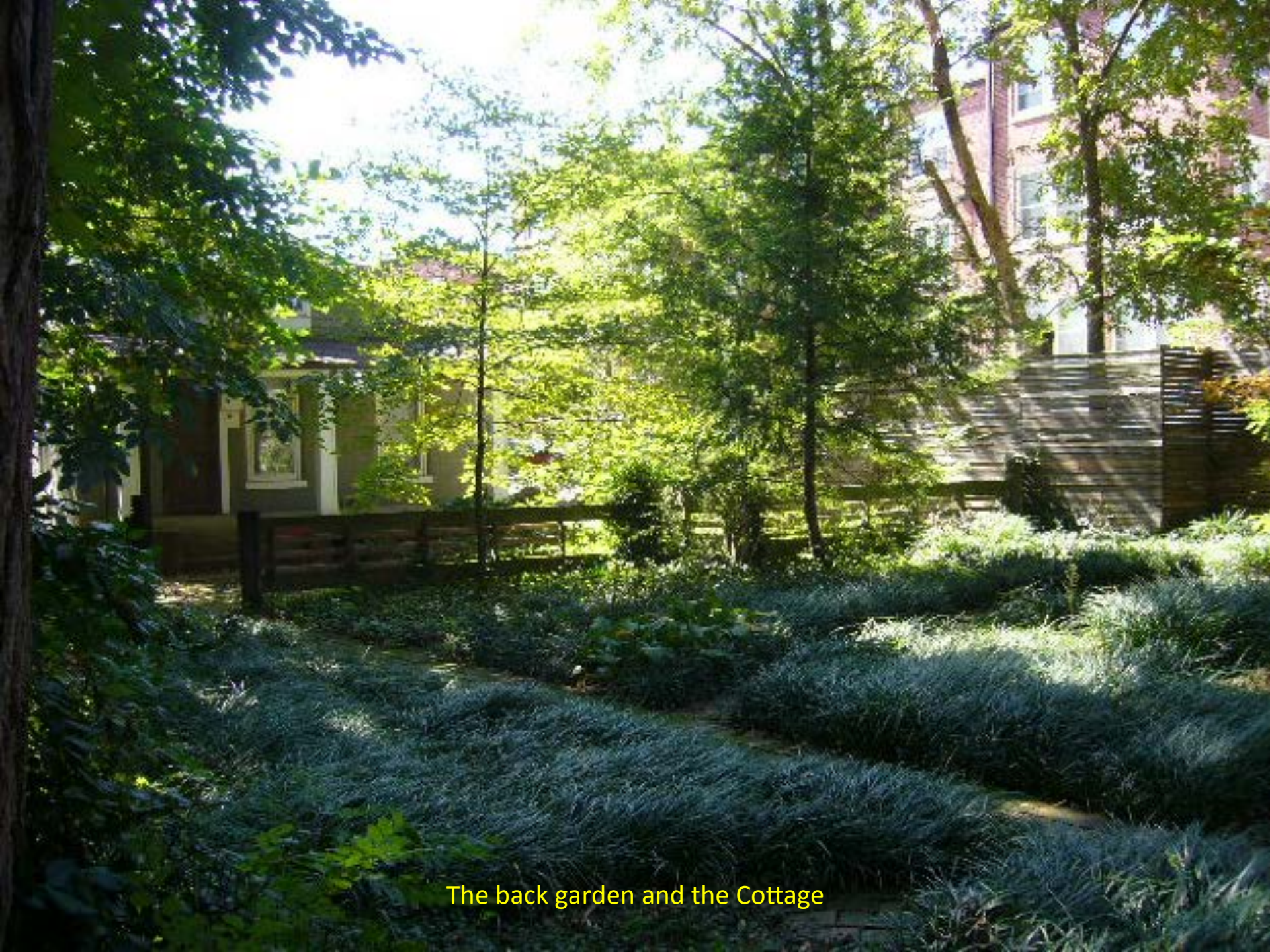
The back garden and the Cottage