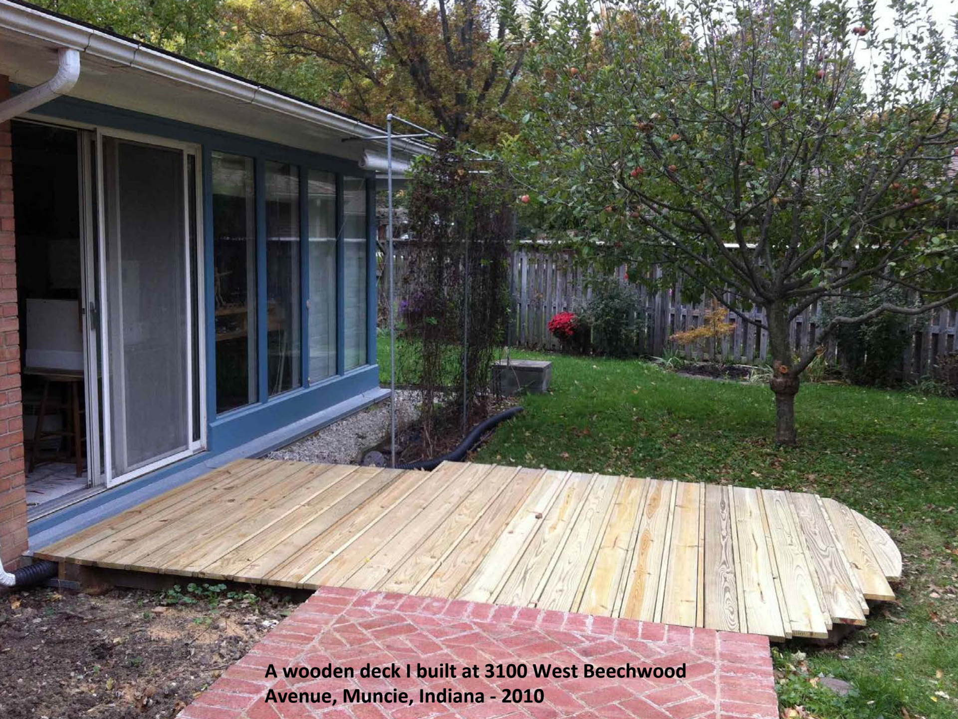
A wooden deck I built at 3100 West Beechwood Avenue, Muncie, Indiana - 2010