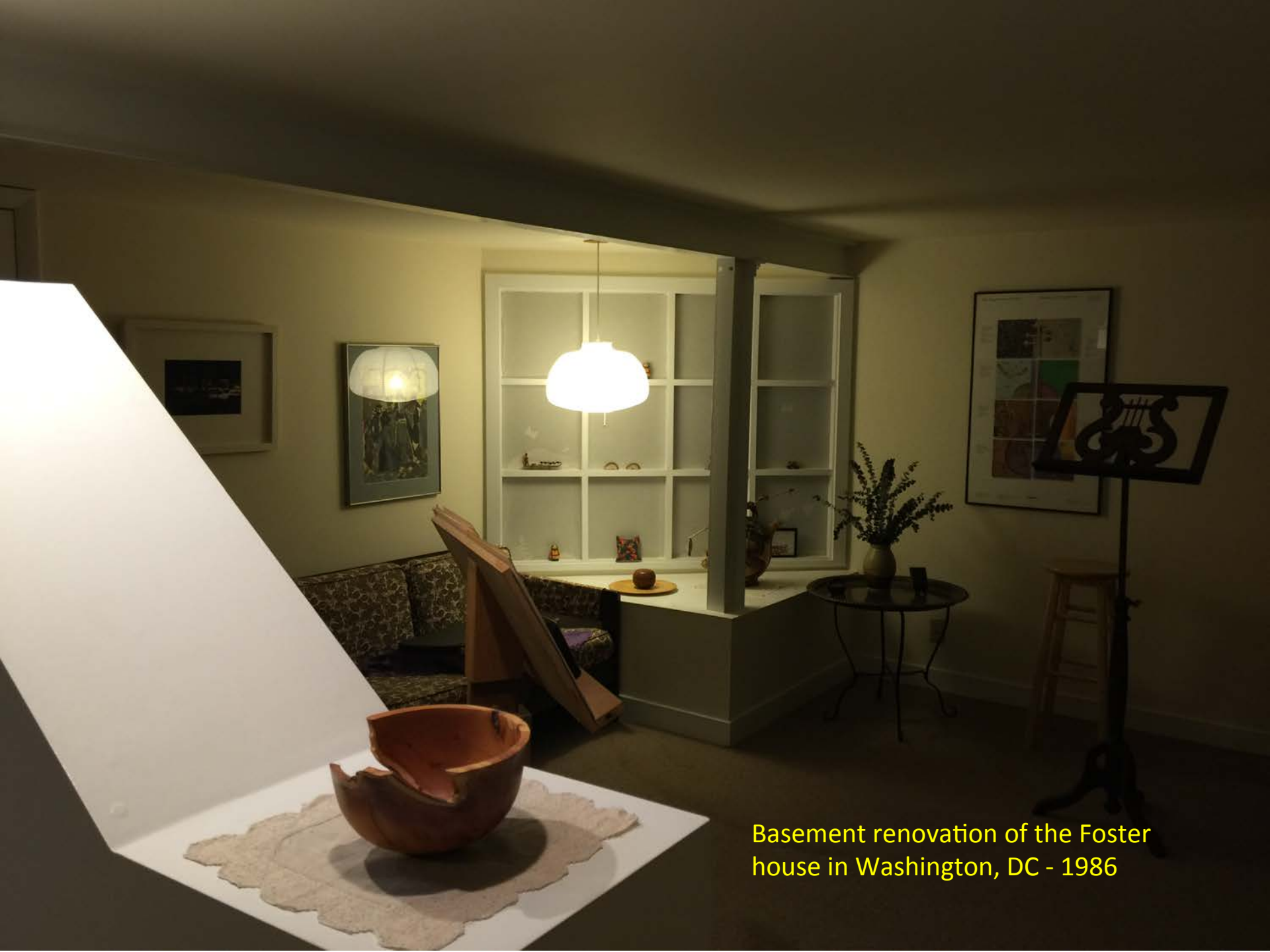
Basement renovation of the Foster house in Washington, DC - 1986