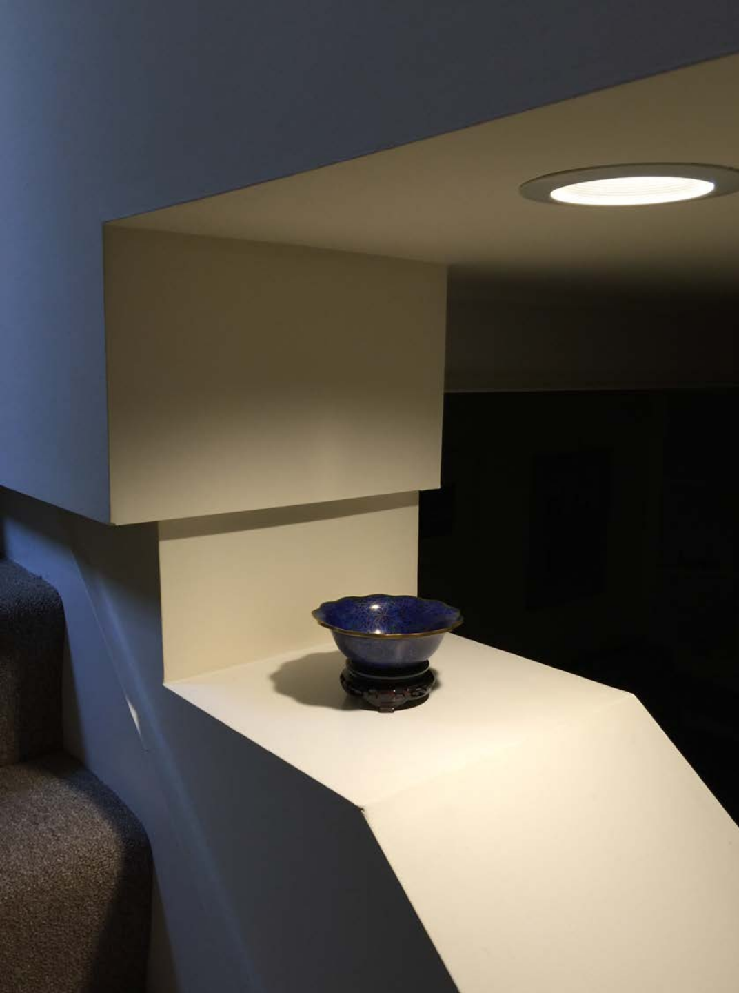
Detail of the basement renovation of the Foster house in Washington, DC - 1986