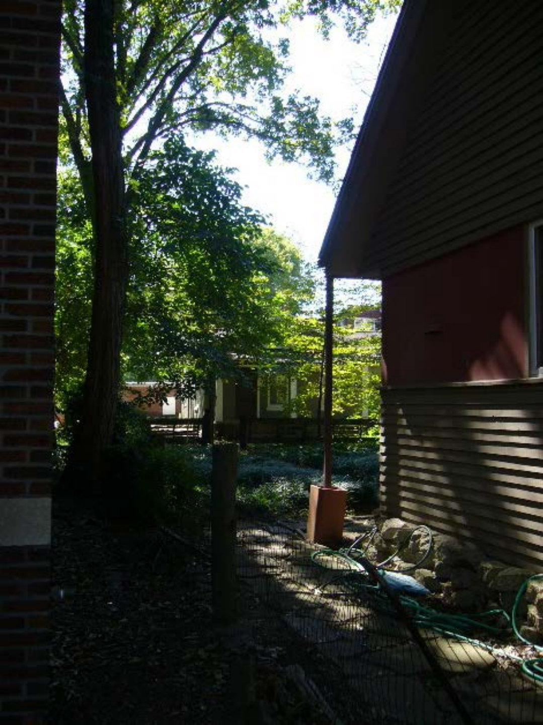
The path leading to the back garden and the cottage