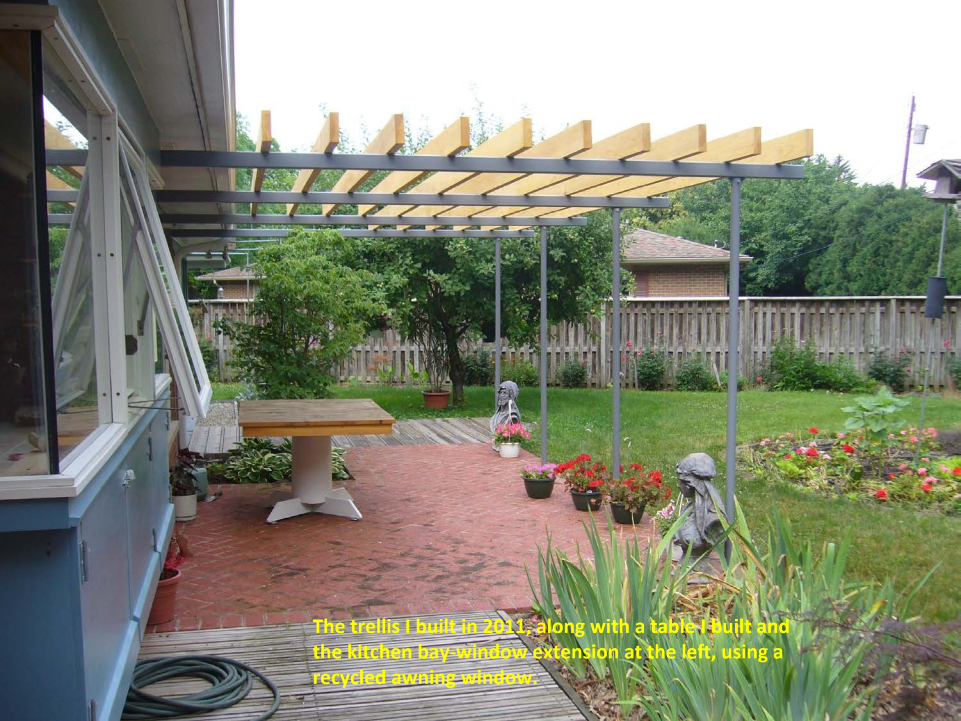
The trellis I built in 2011, along with a table I built and the kitchen bay-window extension at the left, using a recycled awning window.