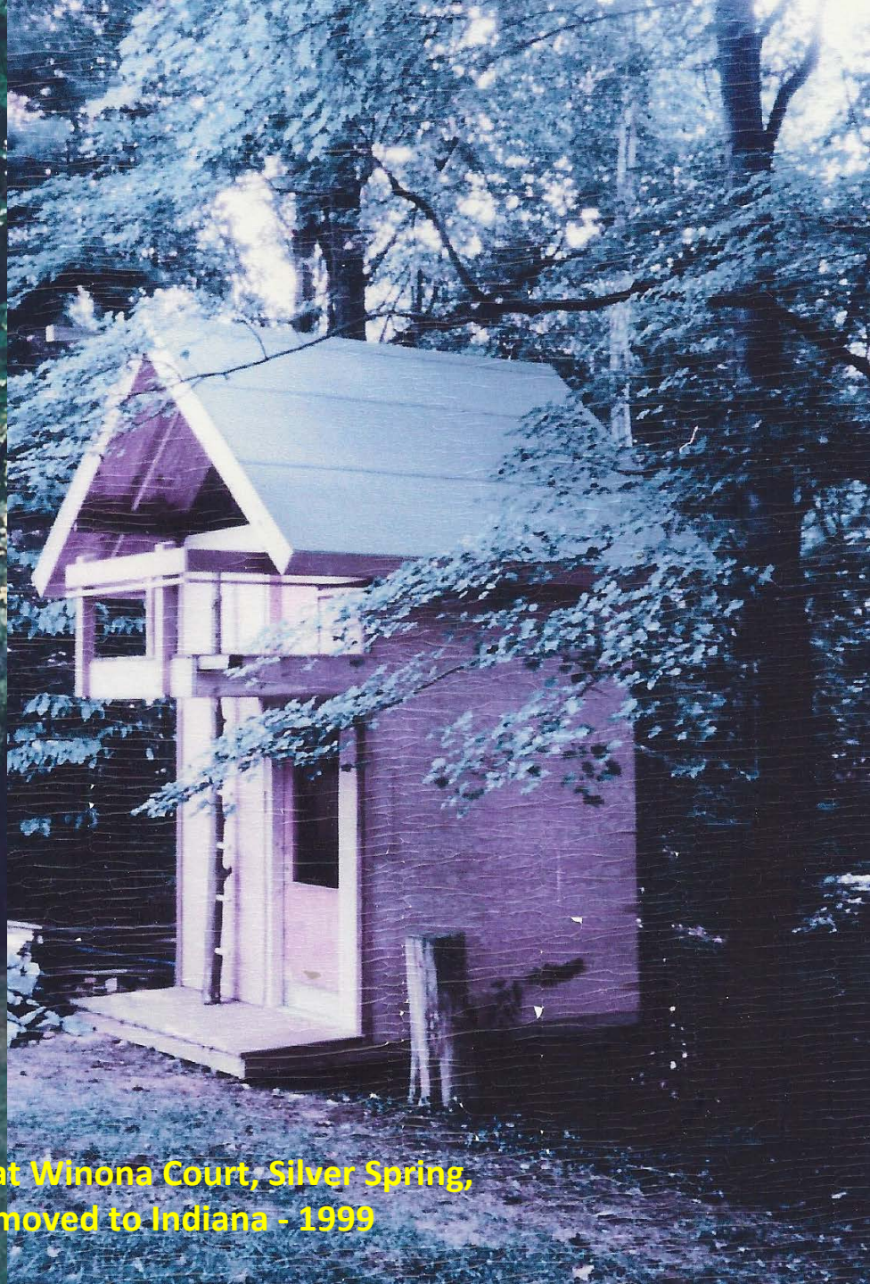
A folly built in the backyard at Winona Court, Silver Spring, MD, the summer before we moved to Indiana - 1999