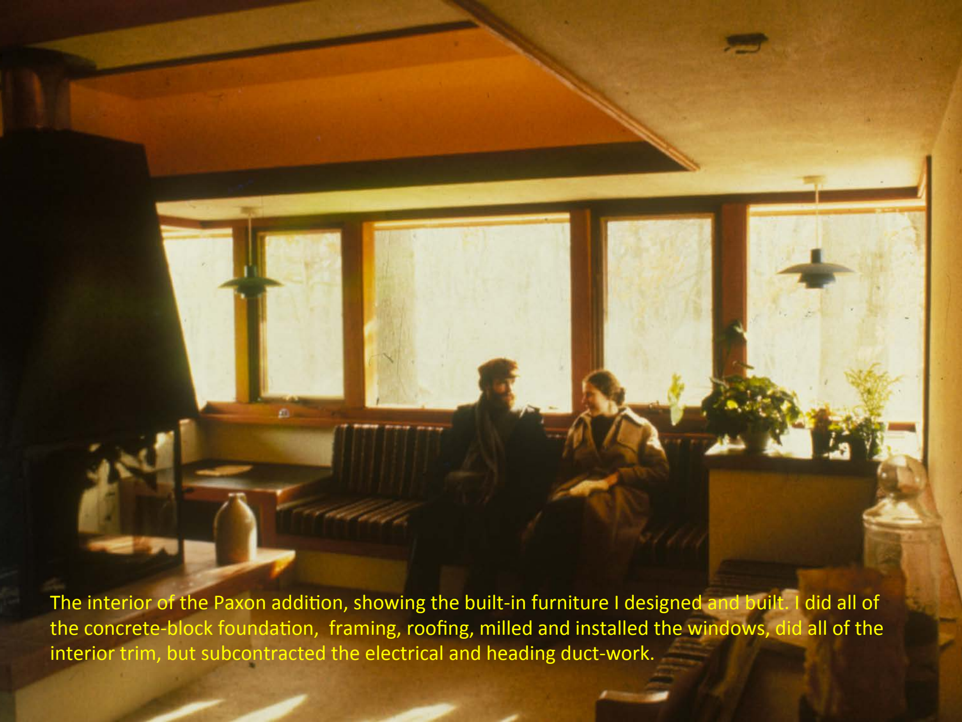
The interior of the Paxon addition, showing the built-in furniture I designed and built. I did all of the concrete-block foundation, framing, roofing, milled and installed the windows, did all of the interior trim, but subcontracted the electrical and heading duct-work.