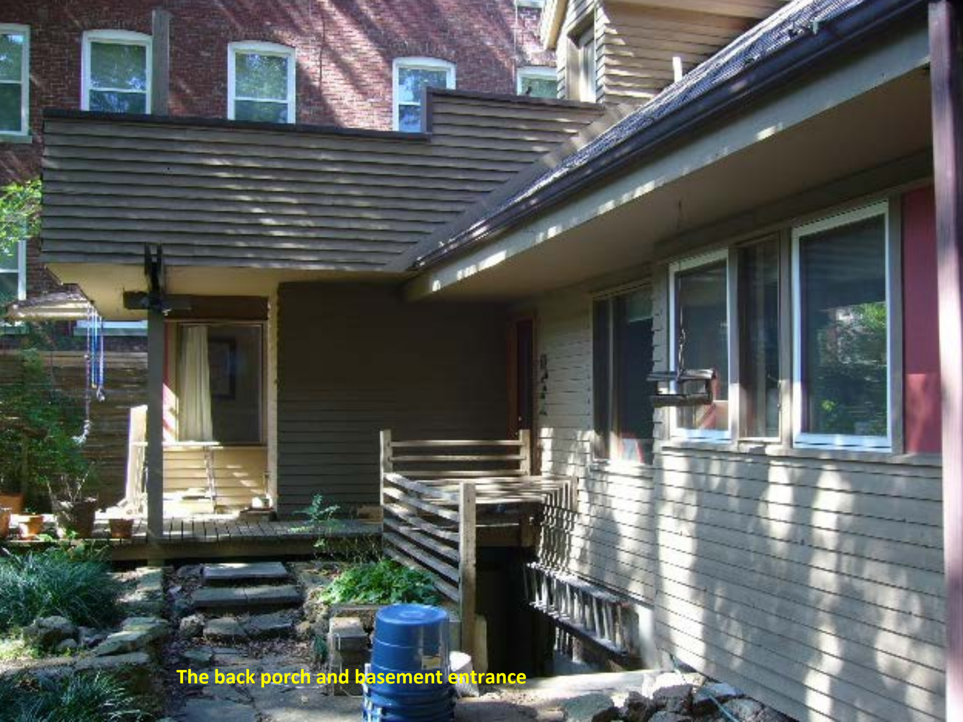
The back porch and basement entrance