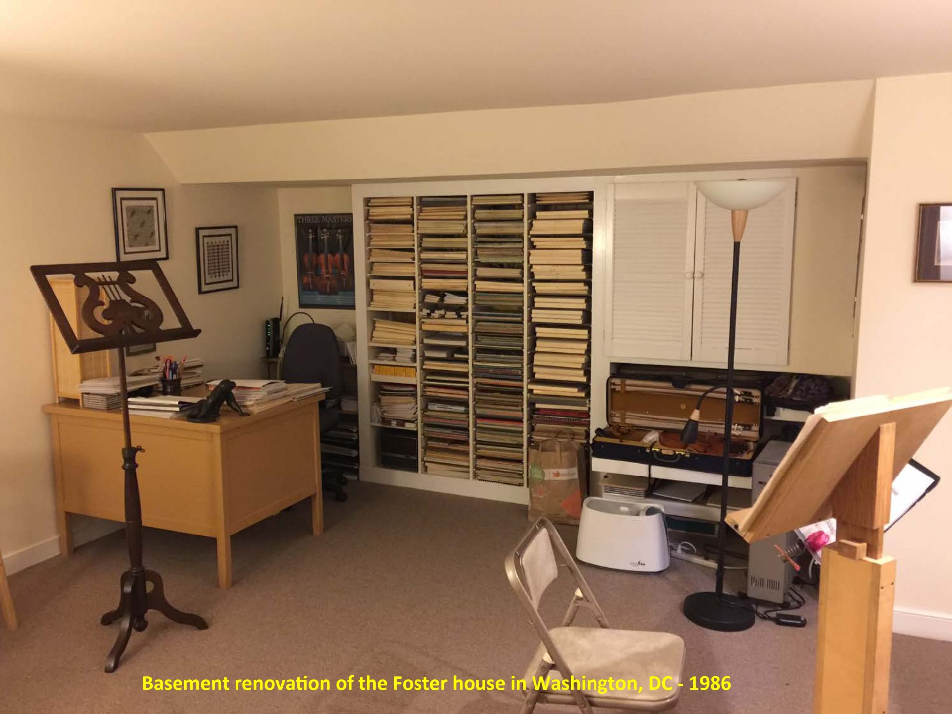
Basement renovation of the Foster house in Washington, DC - 1986