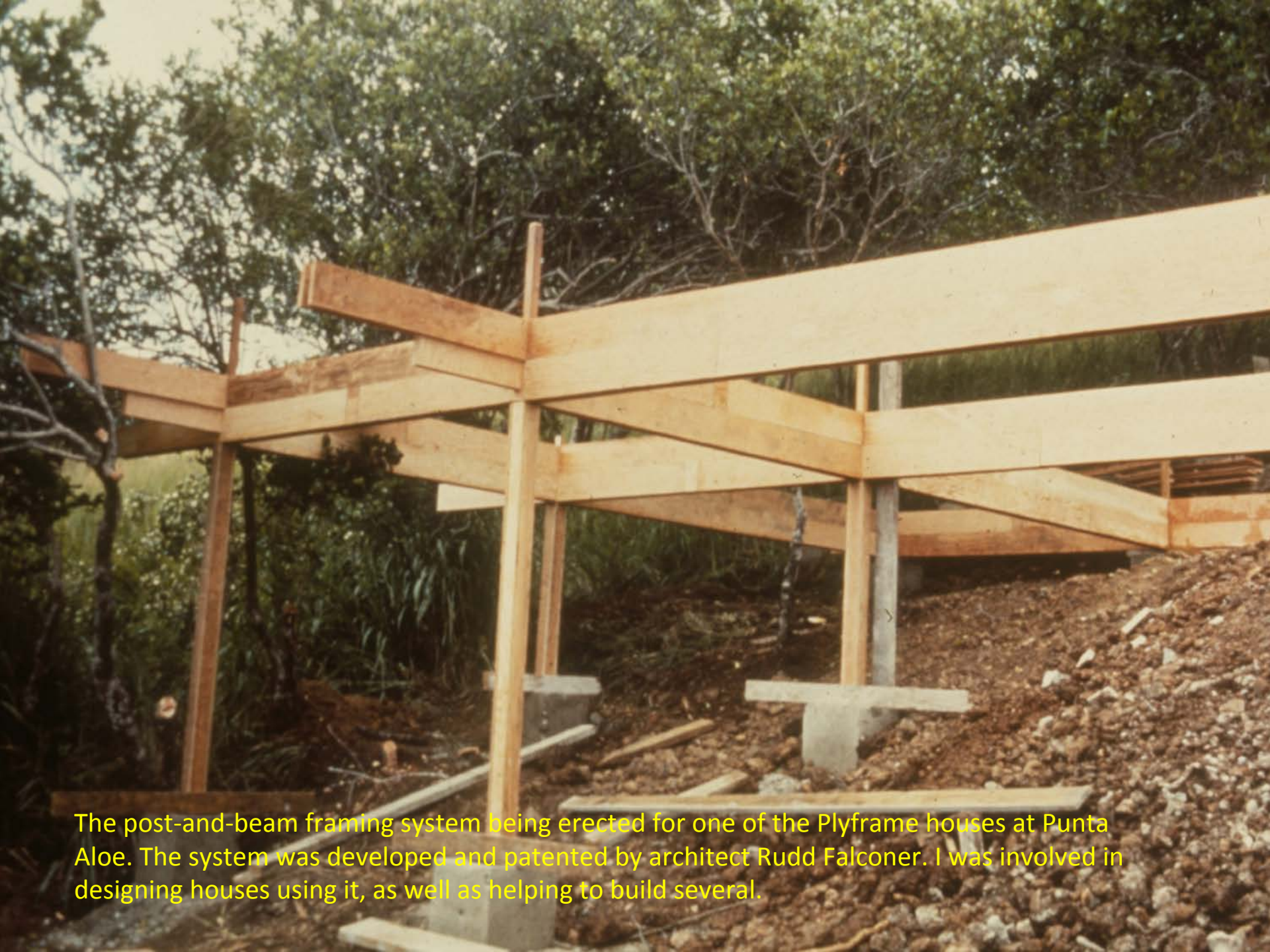
The post-and-beam framing system being erected for one of the Plyframe houses at Punta Aloe. The system was developed and patented by architect Rudd Falconer. I was involved in designing houses using it, as well as helping to build several.