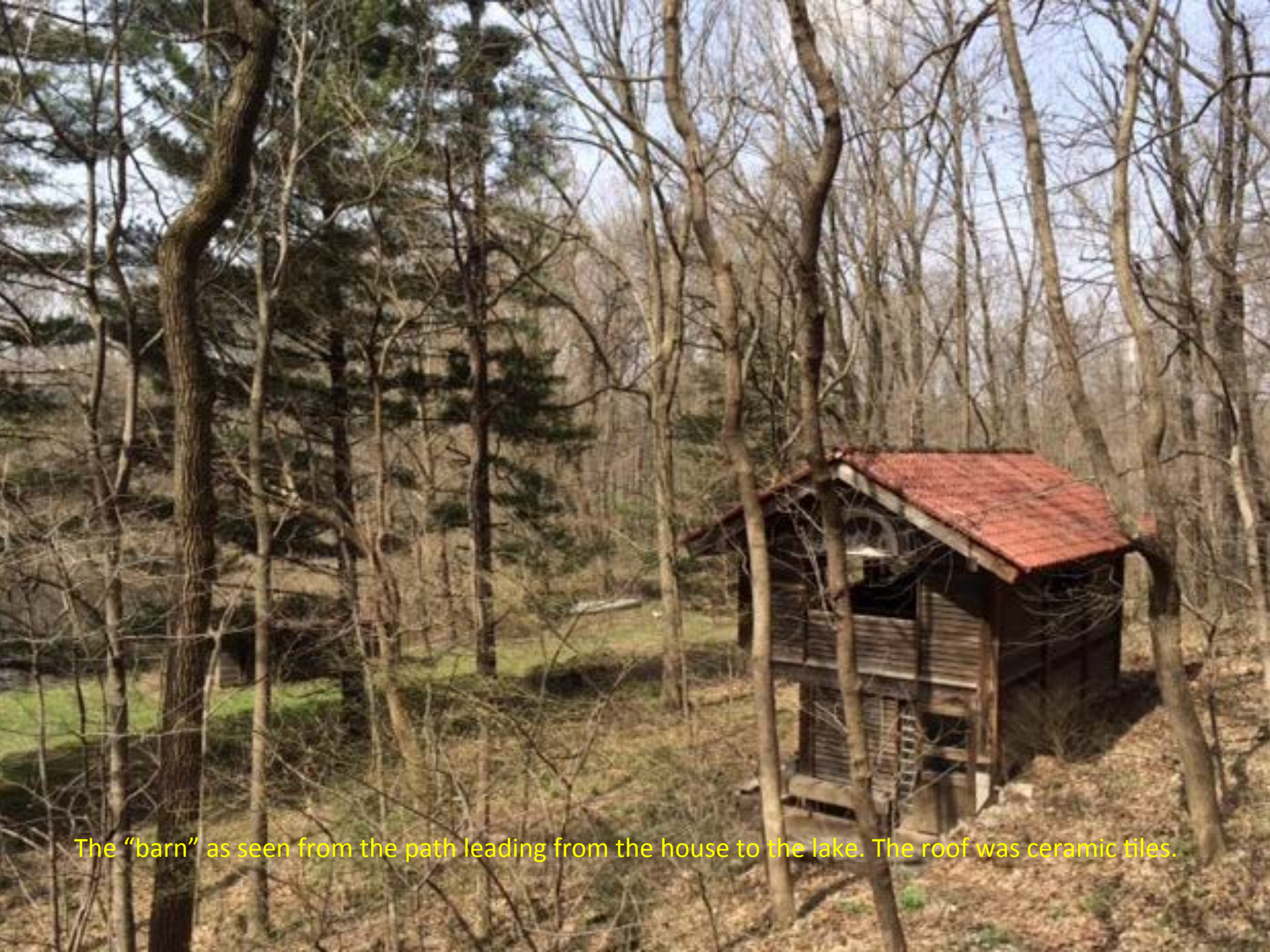
The "barn" as seen from the path leading from the house to the lake. The roof was ceramic tiles.