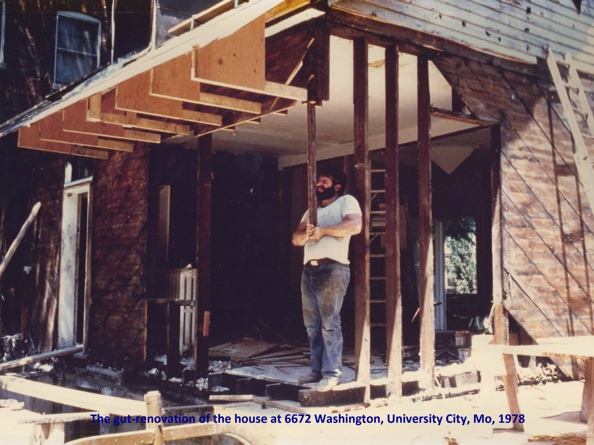
The gut-renovation of the house at 6672 Washington, University City, Mo, 1978