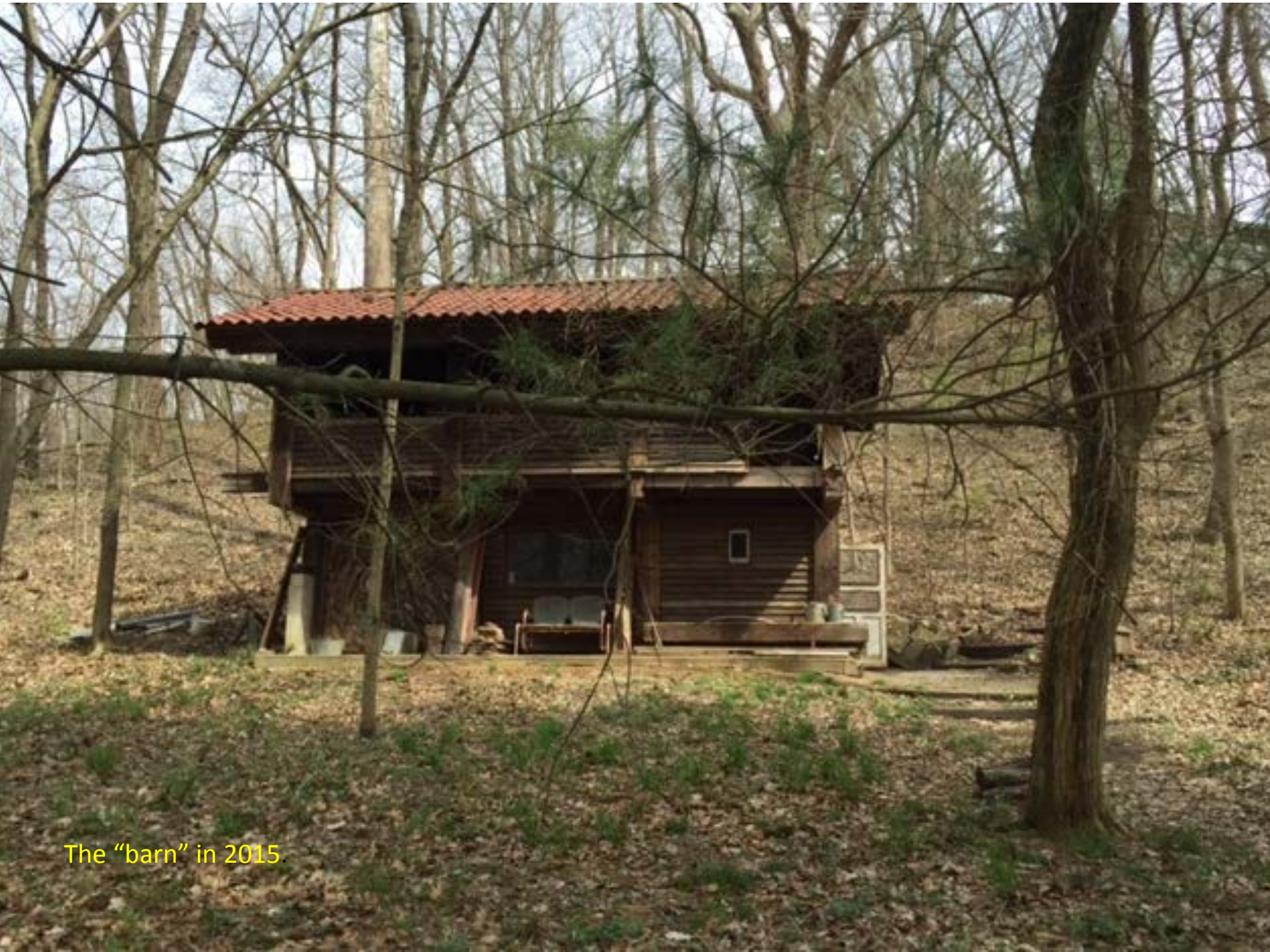
The "barn" in 2015.