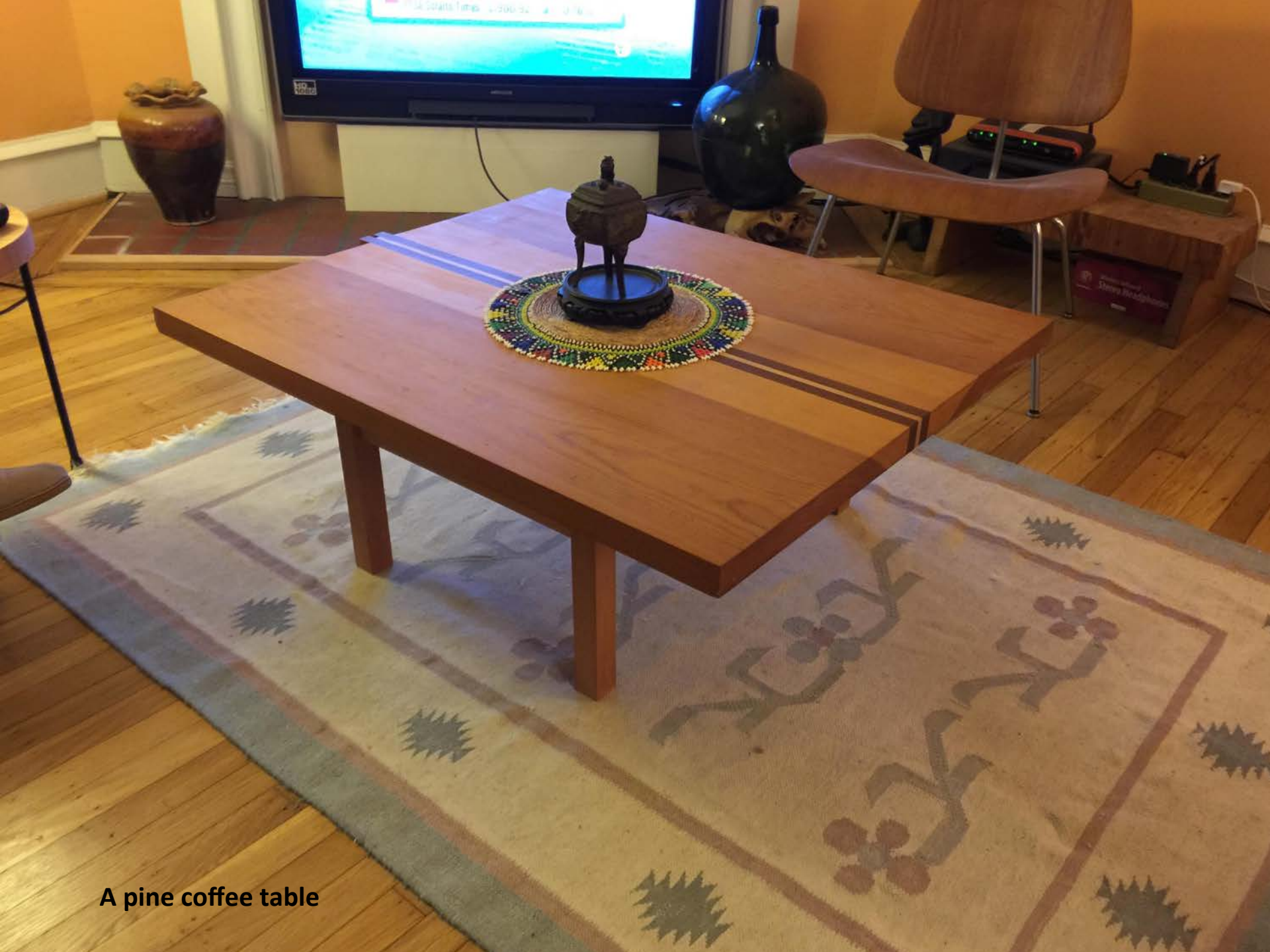
A pine coffee table