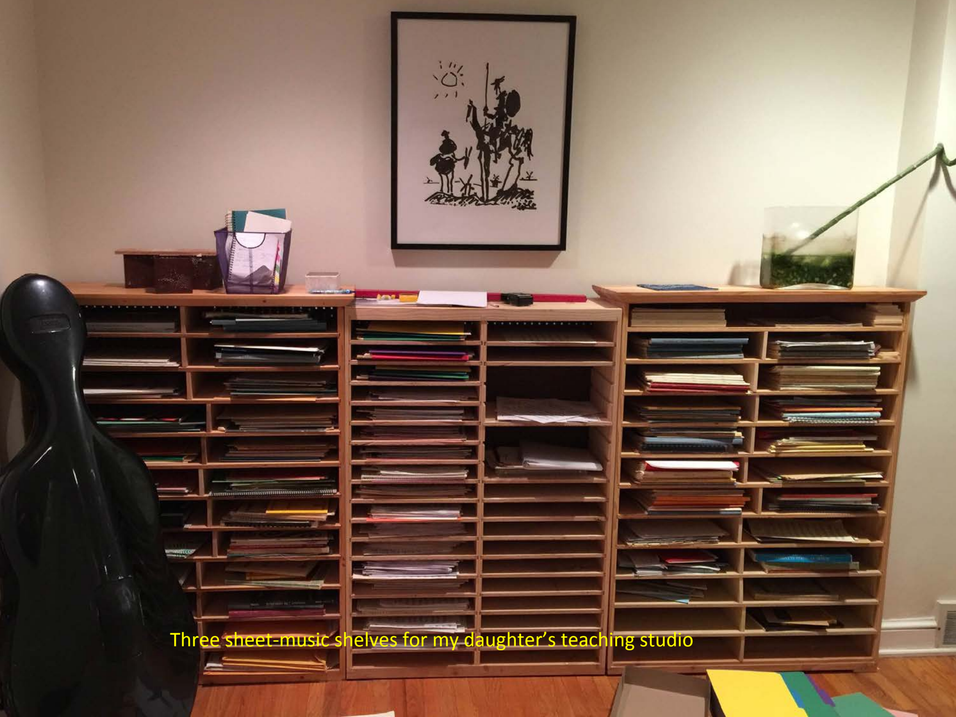
Three sheet-music shelves for my daughter's teaching studio