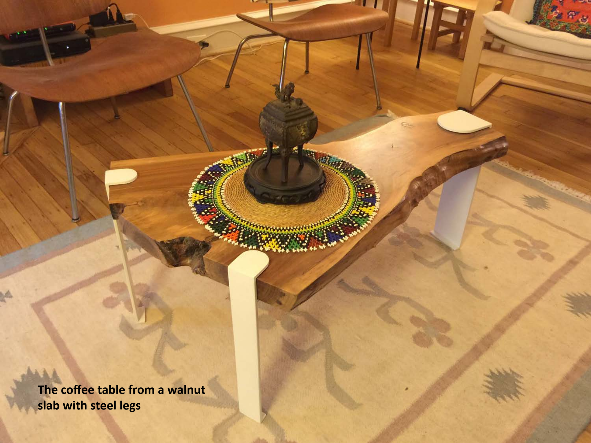
The coffee table from a walnut slab with steel legs