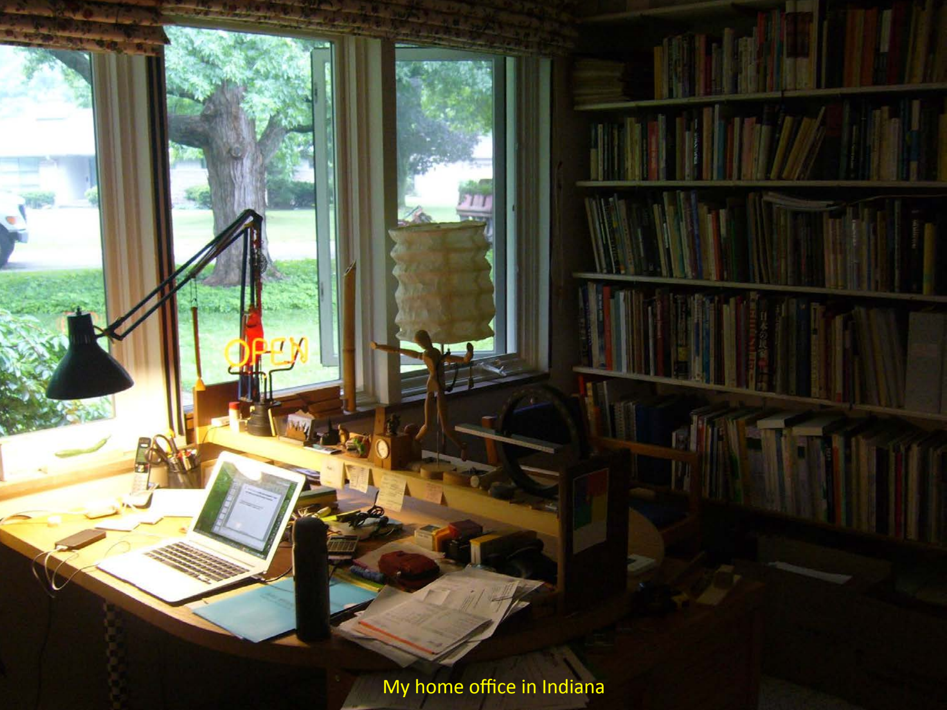
My home office in Indiana