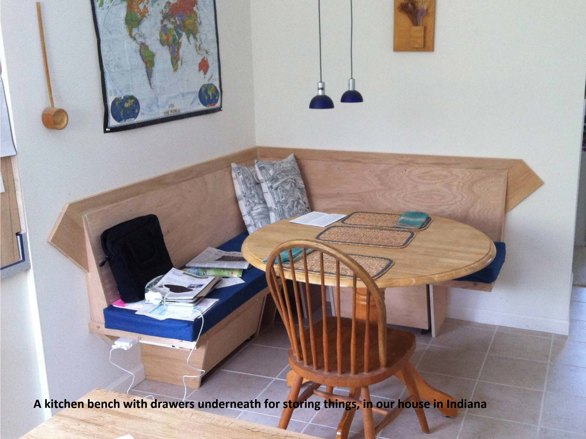
A kitchen bench with drawers underneath for storing things, in our house in Indiana