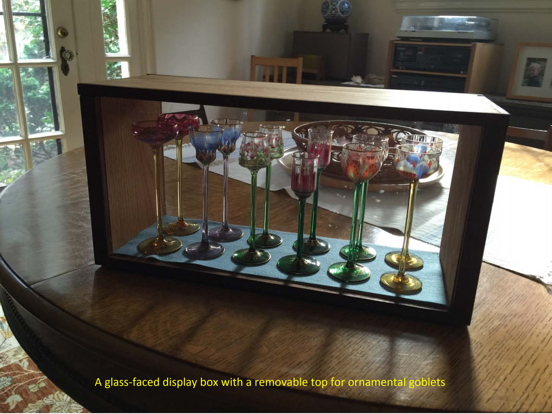
A glass-faced display box with a removable top for ornamental goblets