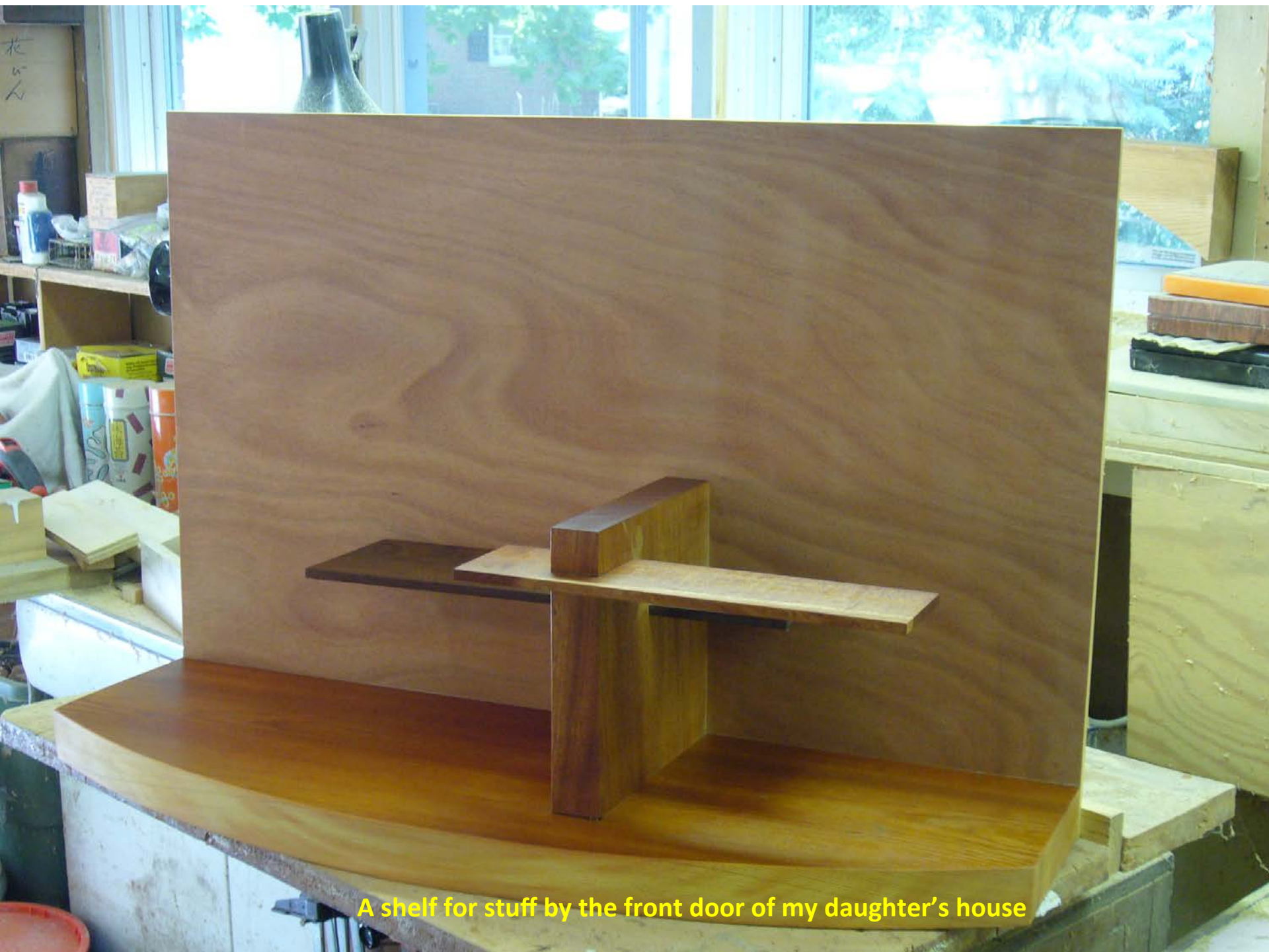
A shelf for stuff by the front door of my daughter's house