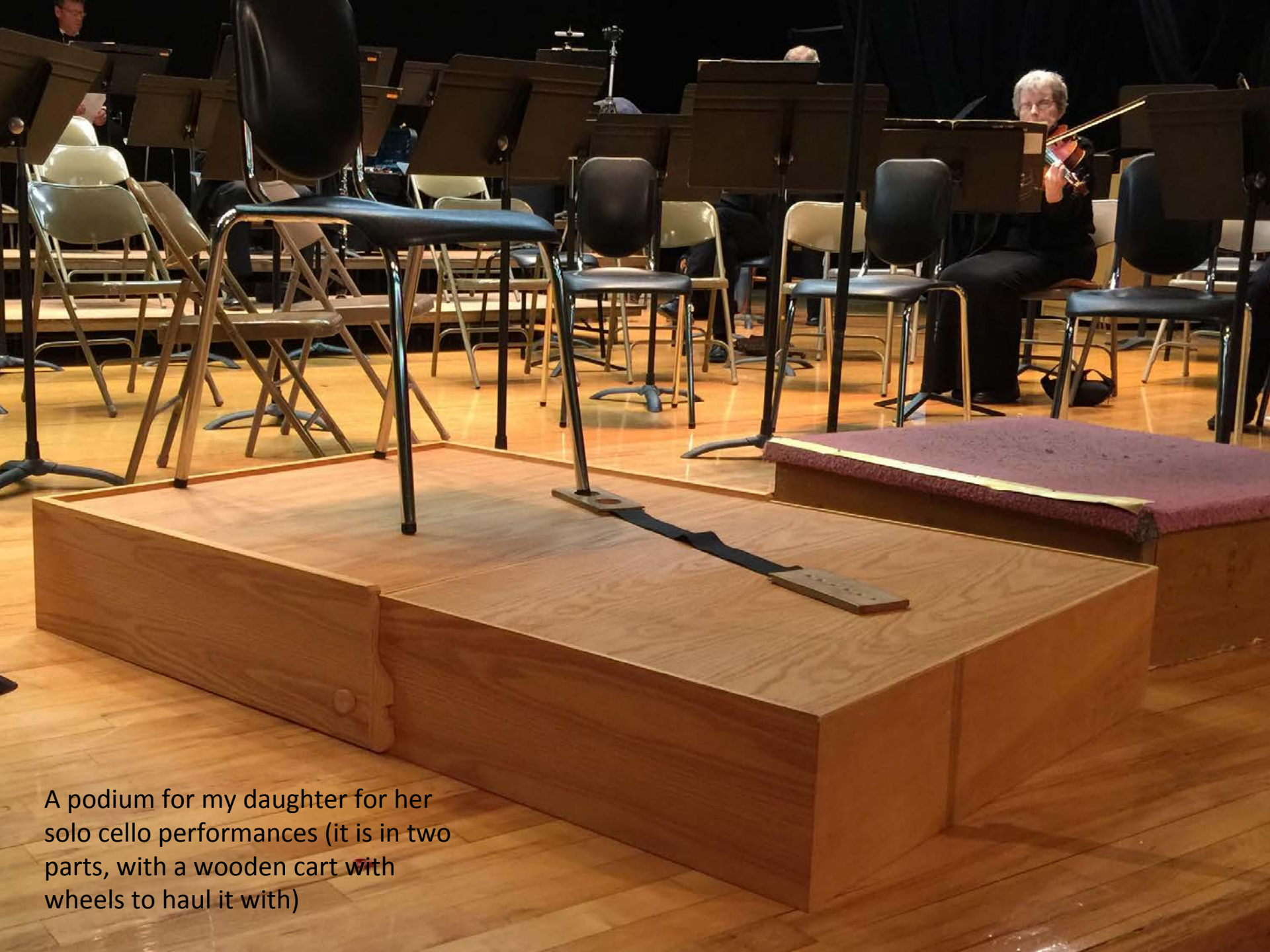
A podium for my daughter for her solo cello performances (it is in two parts, with a wooden cart with wheels to haul it with)