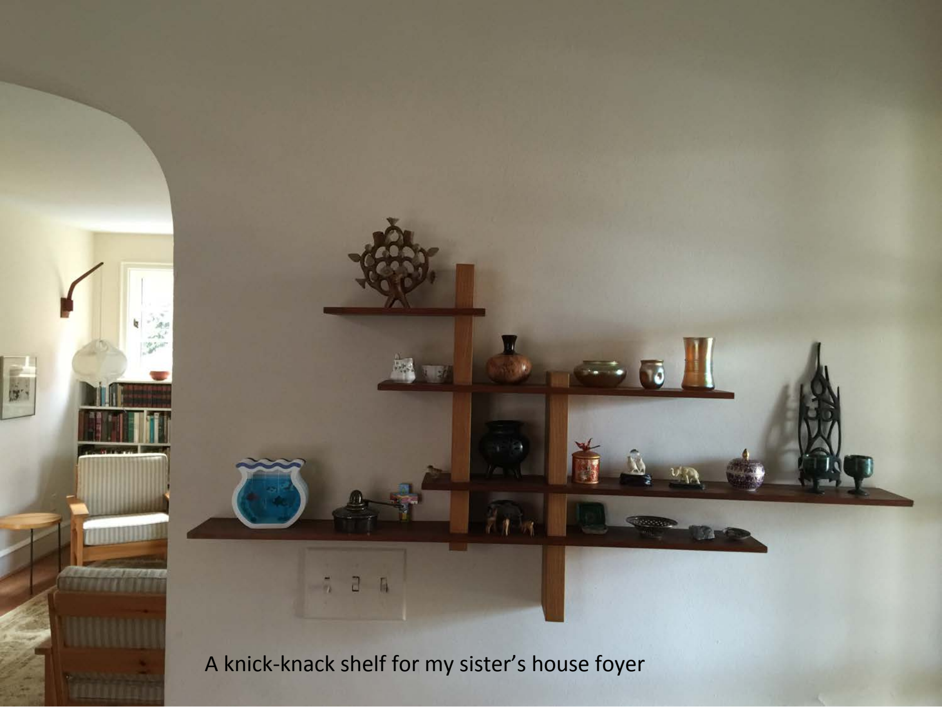
A knick-knack shelf for my sister's house foyer