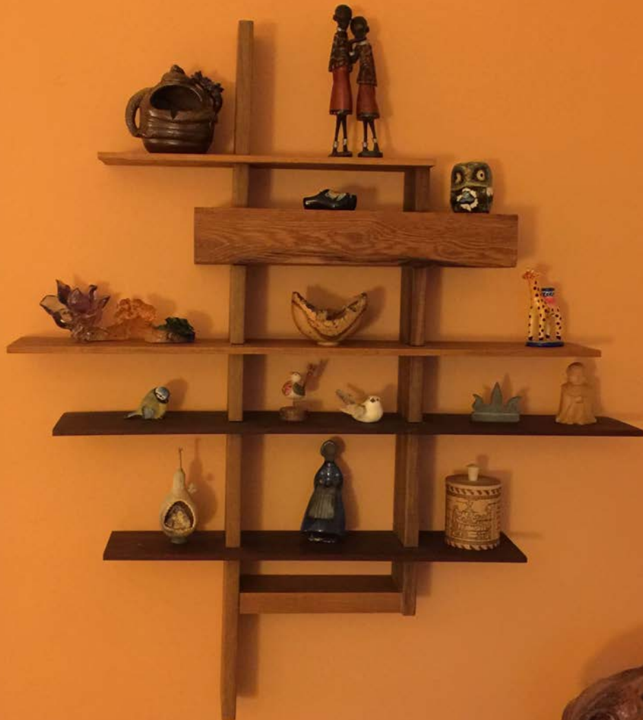
A knick-knack shelf