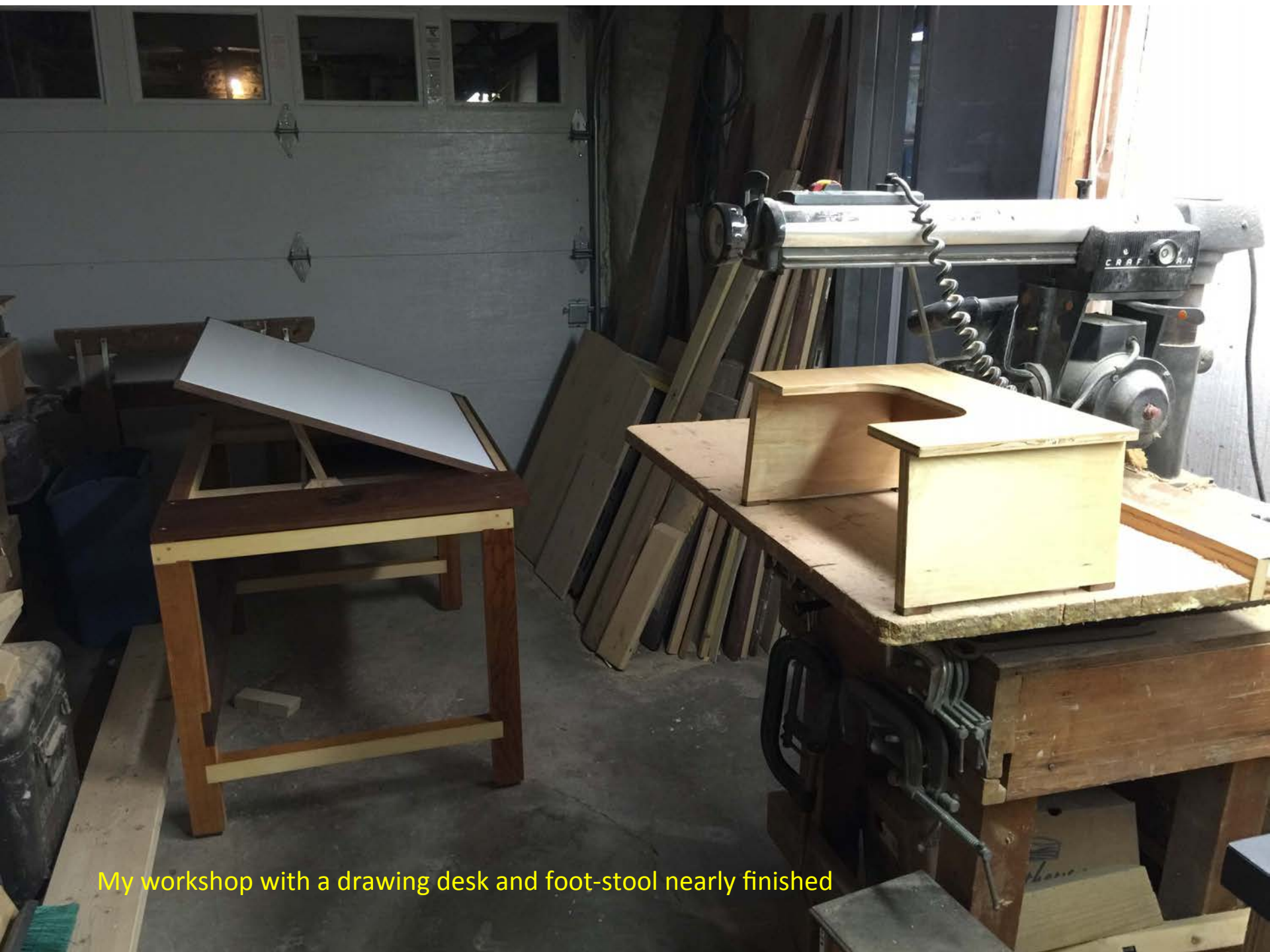
My workshop with a drawing desk and foot-stool nearly finished