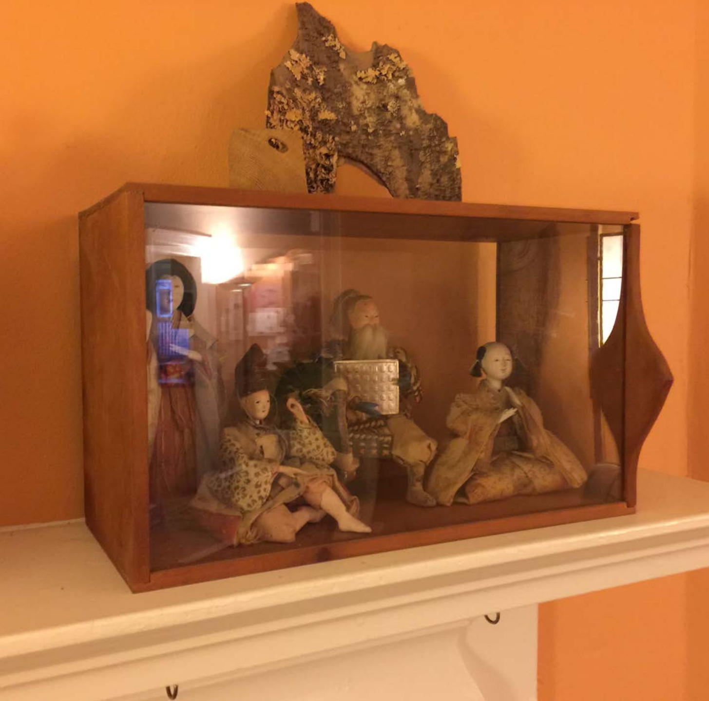
A display box with sliding glass front