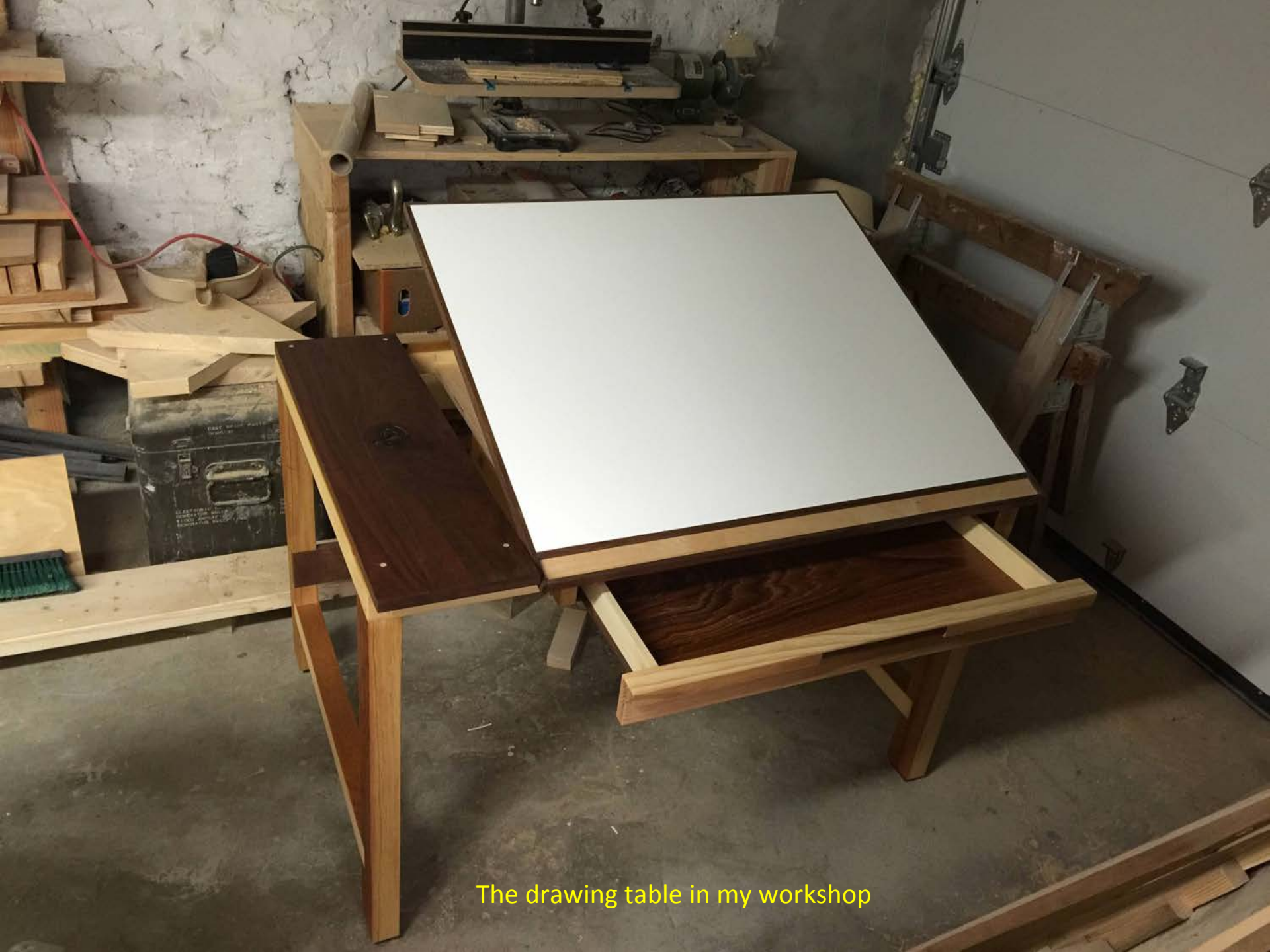
The drawing table in my workshop