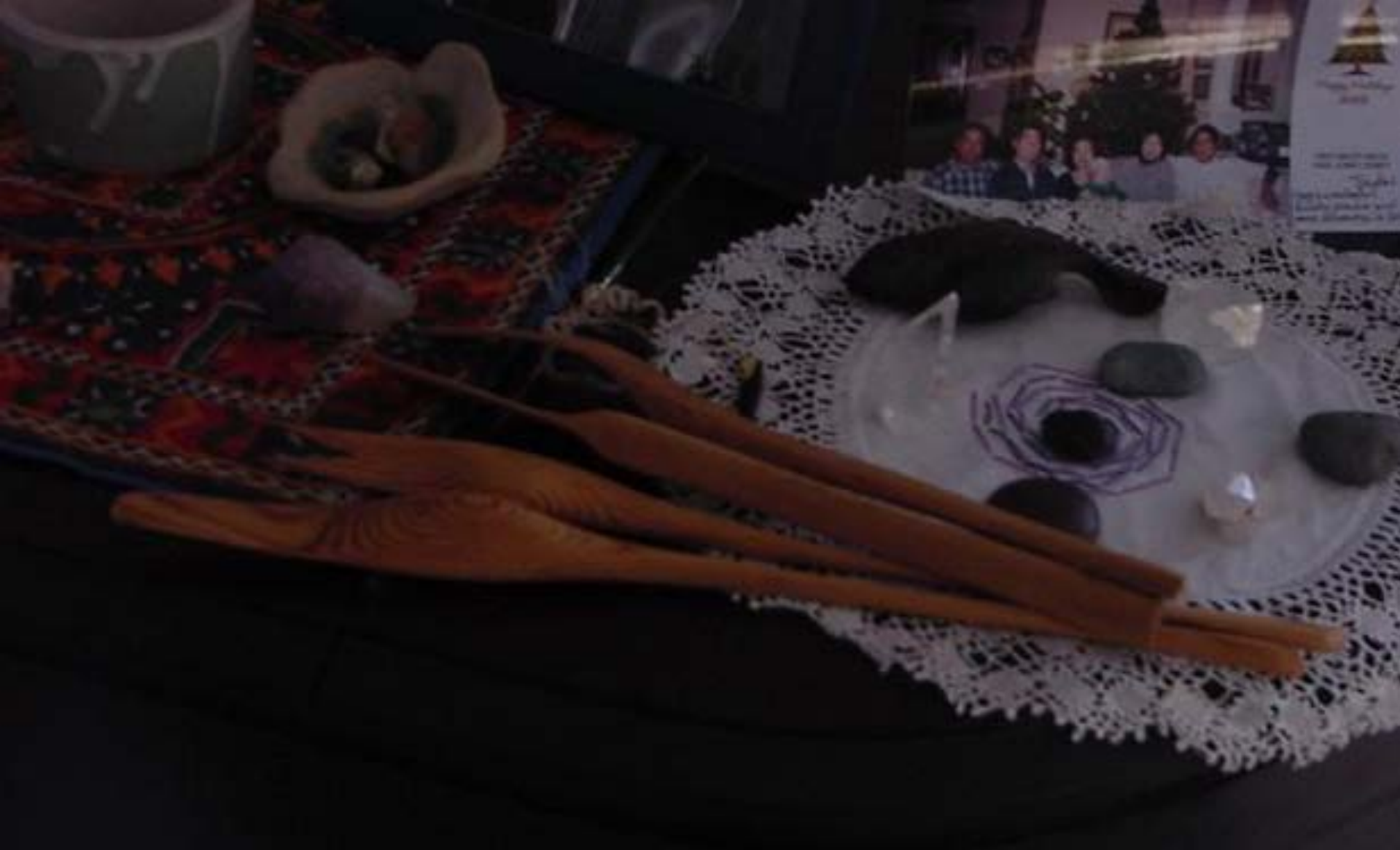
Carved salad forks (made when I was 17 years old)