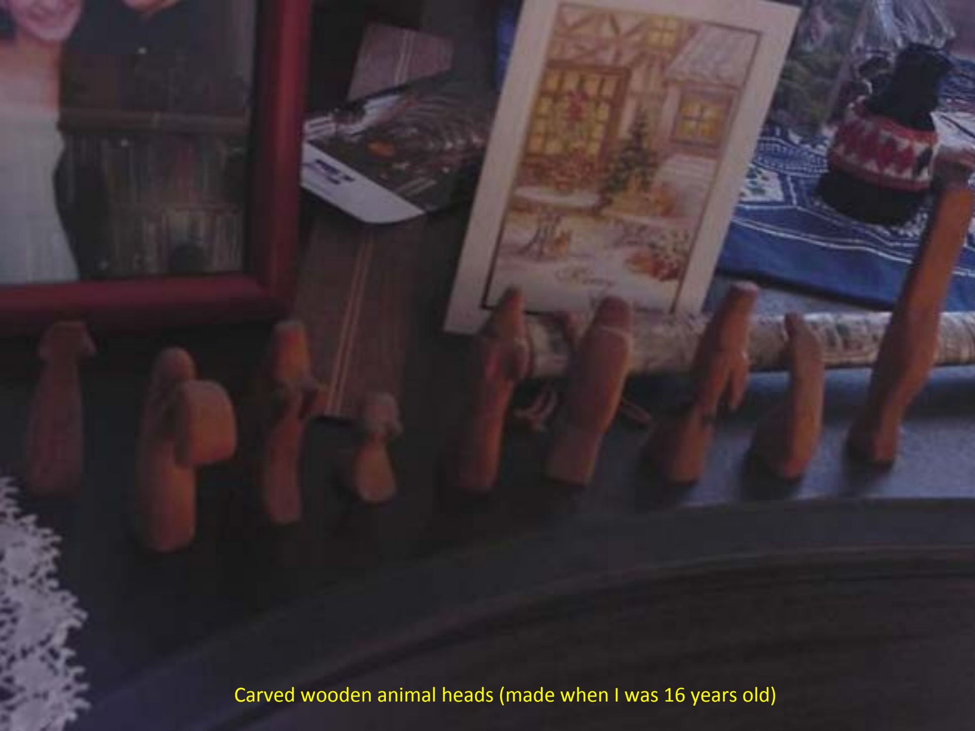
Carved wooden animal heads (made when I was 16 years old)