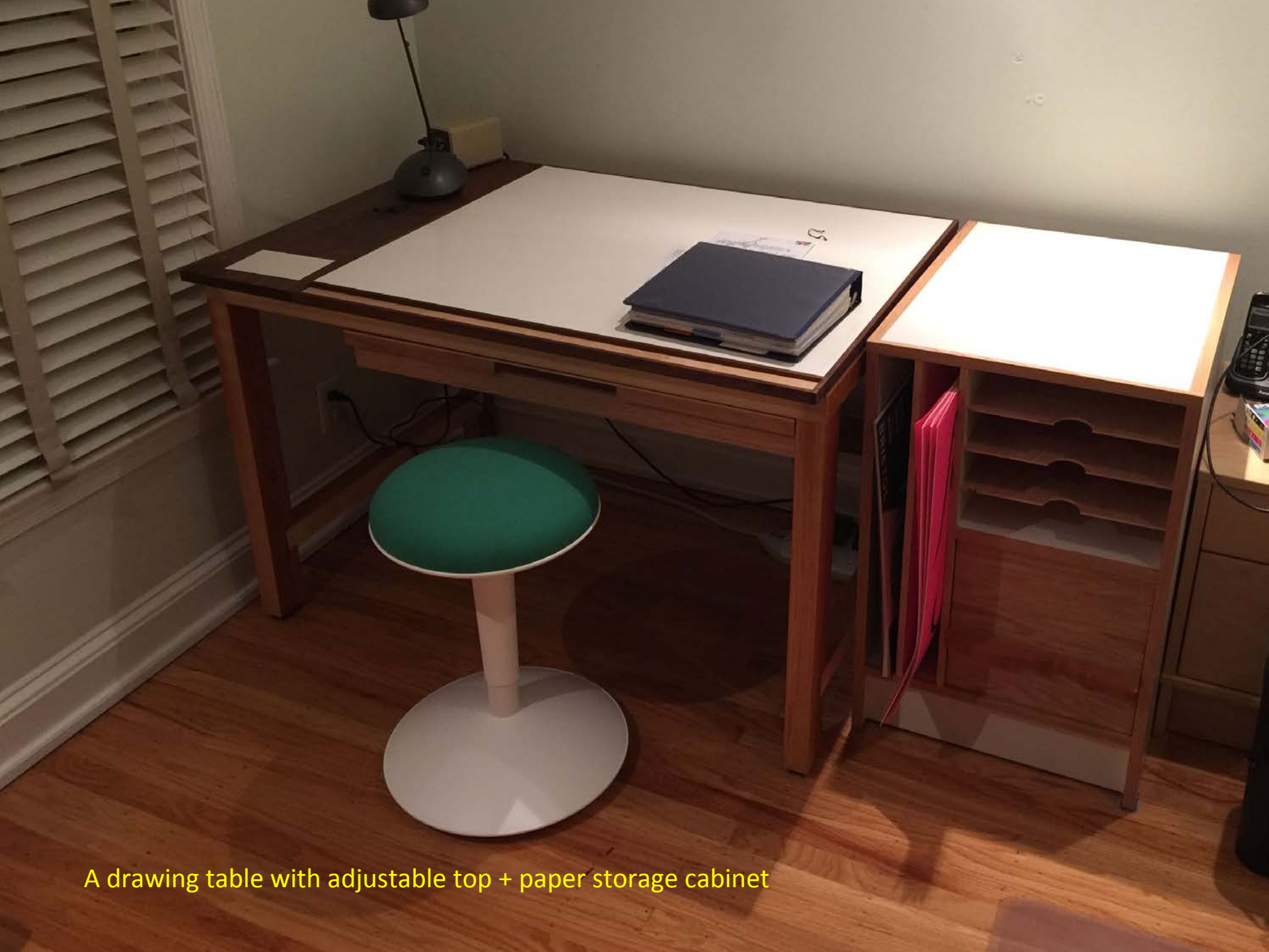
A drawing table with adjustable top + paper storage cabinet