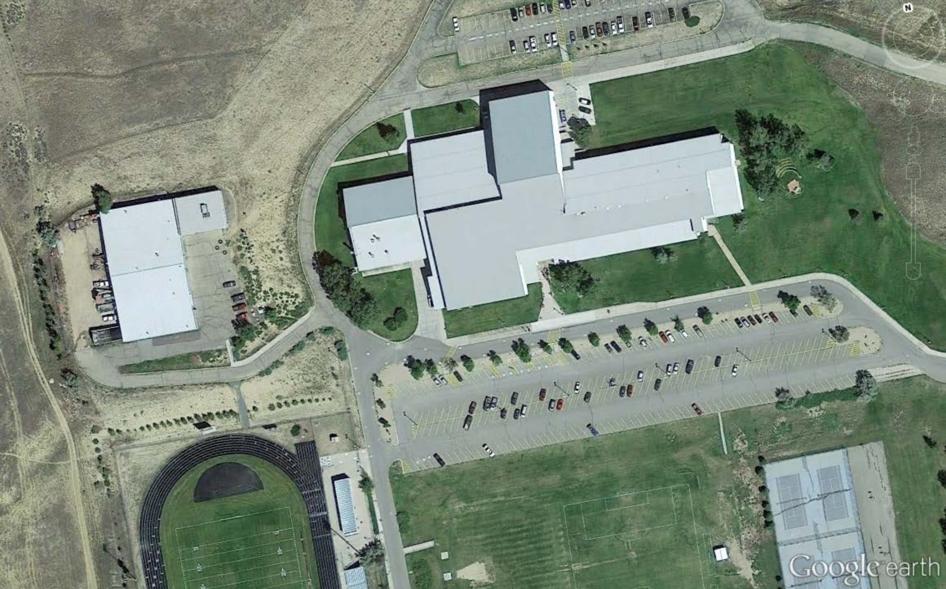
Moffat County, High School, Moffat, Colorado – 1980-82 (I was the project designer)