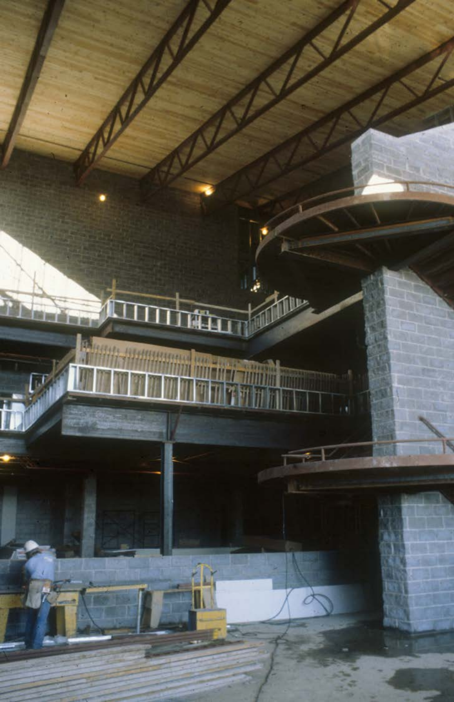
Moffat County, High School, Moffat, Colorado central entrance atrium – 1980-82 (I was the project designer)