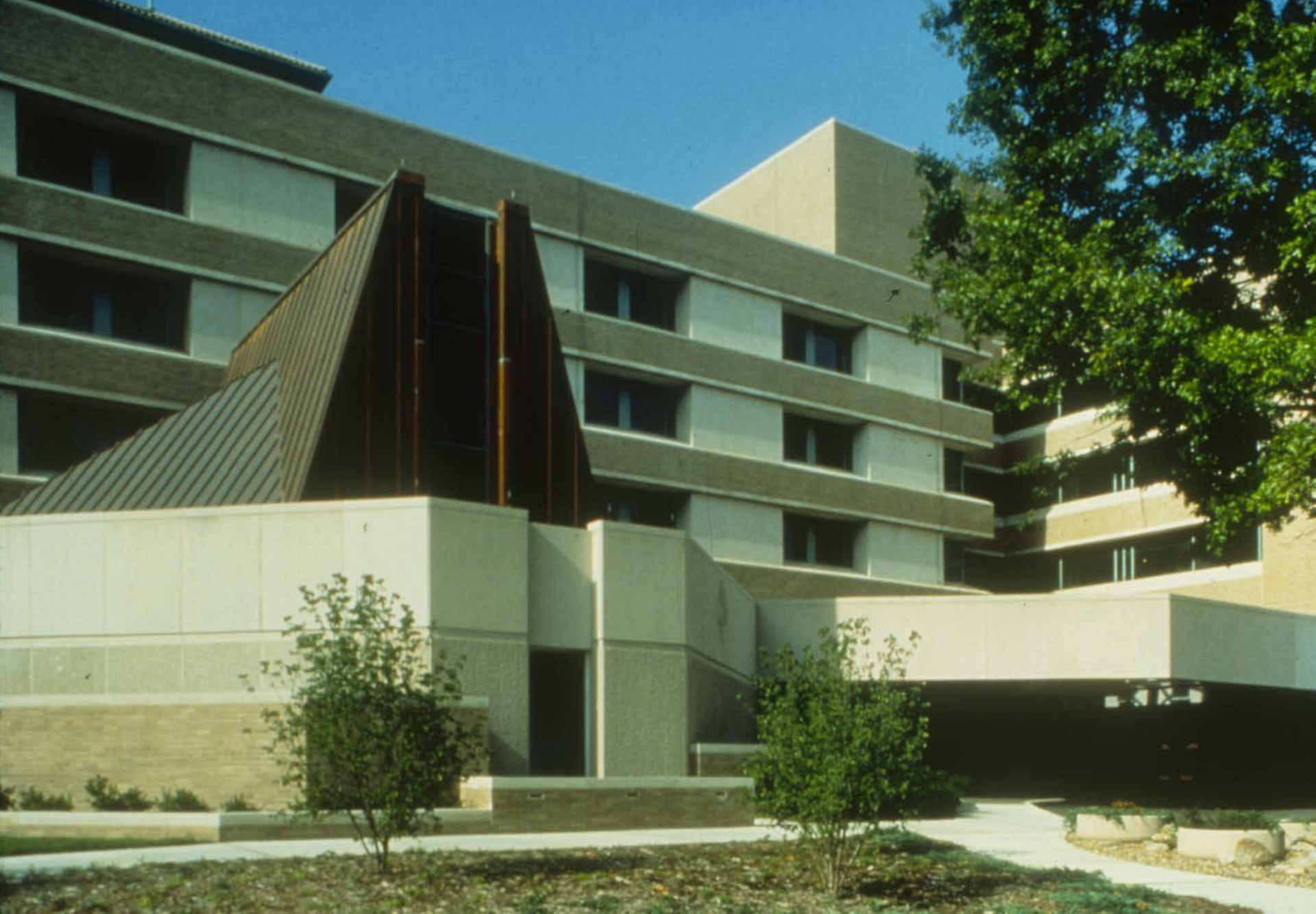
St. Mary's Health Center, Clayton, MO – 1979-81 (I designed the building's façade and did the CD's for the chapel)