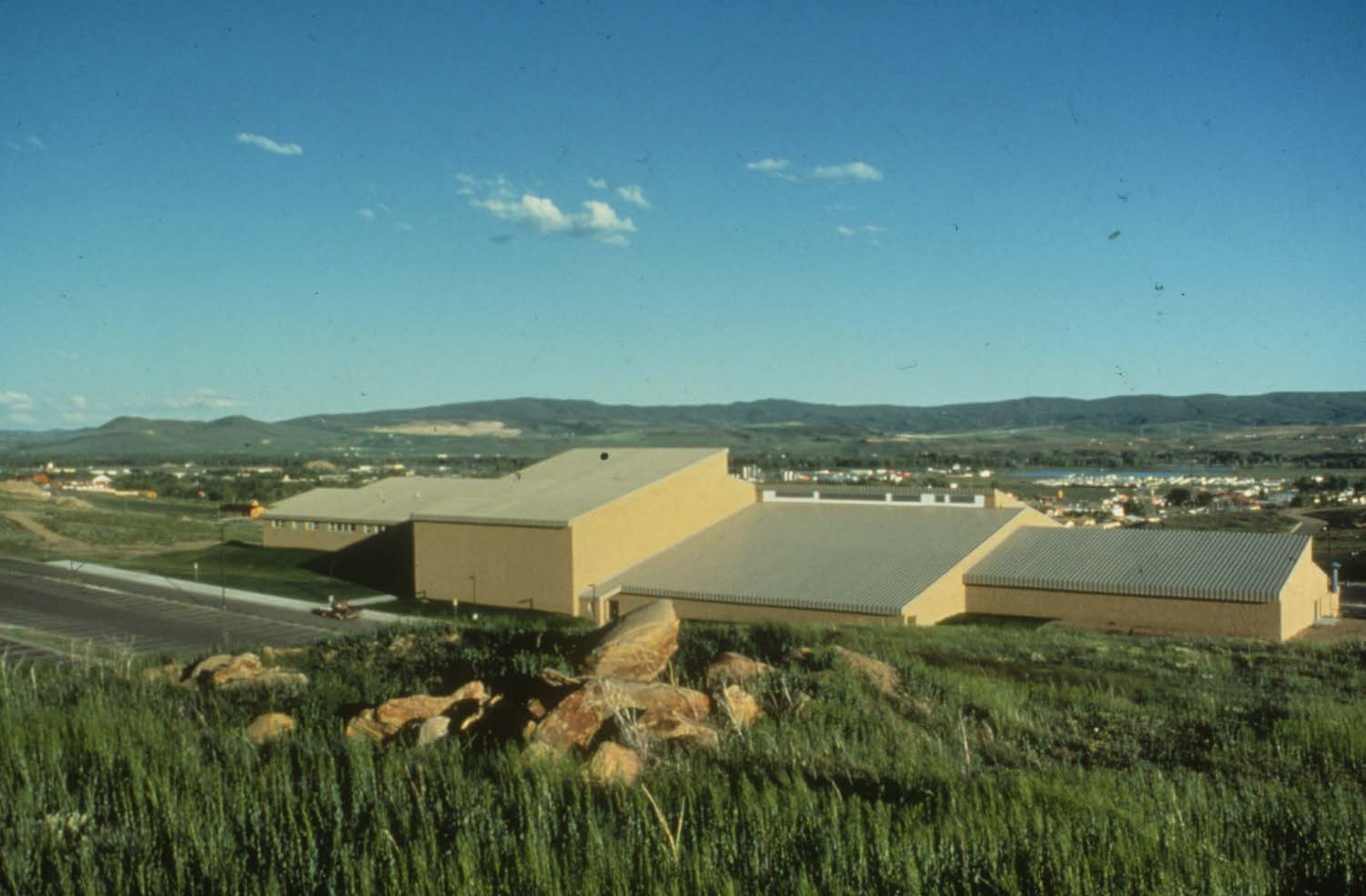
Moffat County, High School, Moffat, Colorado – 1980-82 (I was the project designer)