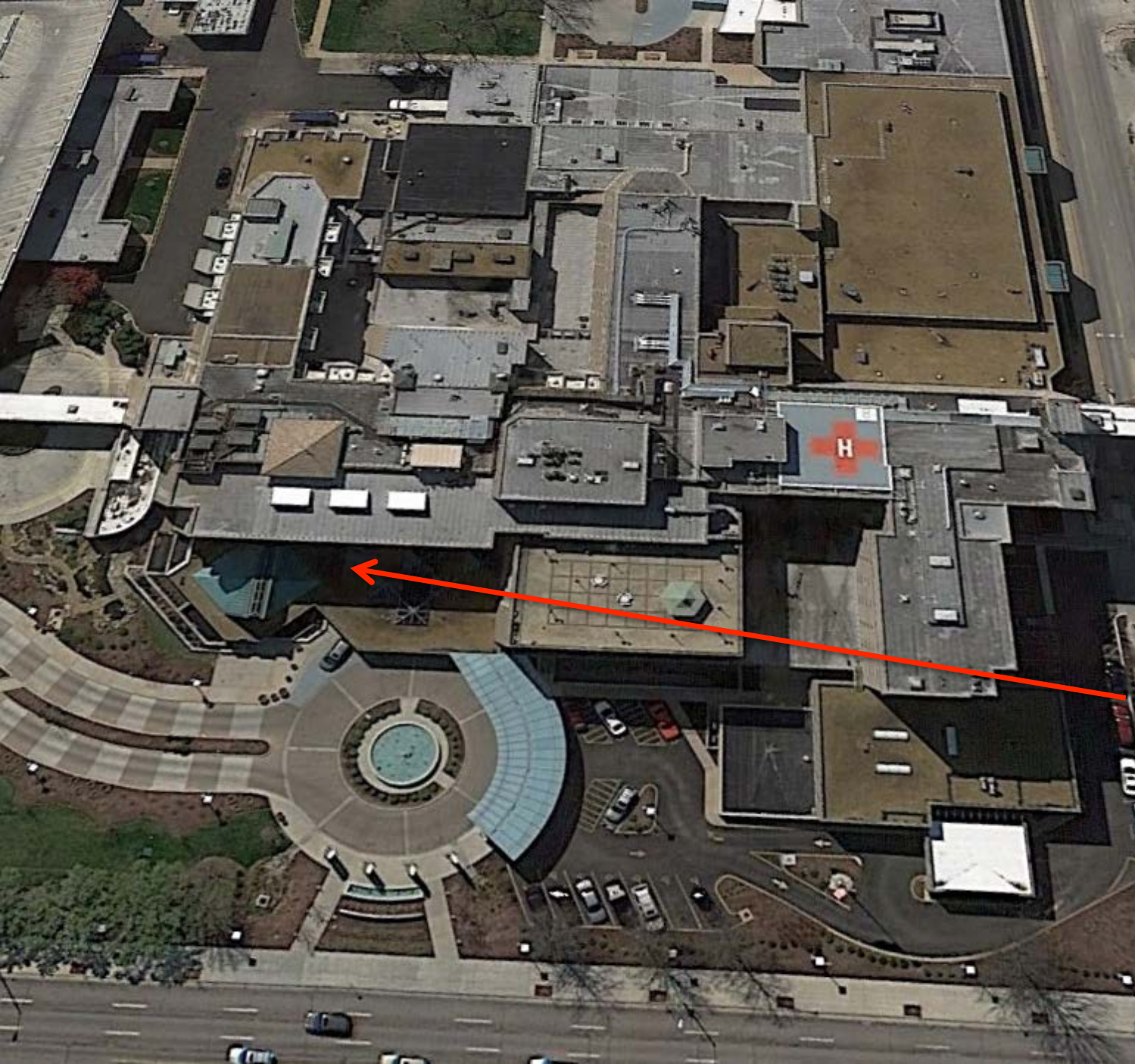
St. Mary's Health Center, Clayton, MO - 1979-81 (I designed the building's façade and did the CD's for the chapel)